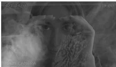
Funke Collective Berlin