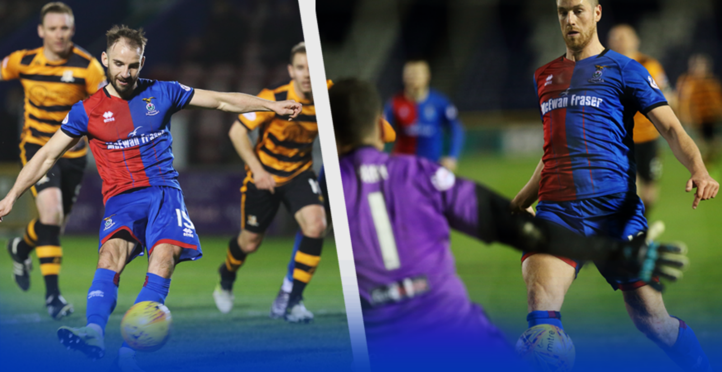
WELSH CONVERTS THE PENALTY & WHITE ABOUT TO LIFT THE BALL OVER THE KEEPER FOR HIS GOAL