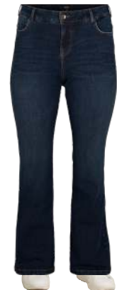
ELLEN Curvy Hip High Waist Bootcut