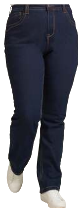
MOLLY Curvy Hip High Waist Slim Leg