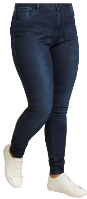
AMY Curvy Hip High Waist Super Slim Leg

The Zizzi jeans program consists of our well-known models and fits. This season the program still includes jeans with specific names, that helps you find your favorite pair of jeans every season.