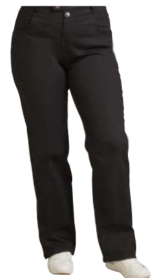
GEMMA Curvy Hip High Waist Regular Leg