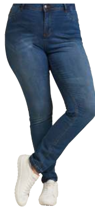
NILLE Curvy Hip High Waist Extra Slim Leg