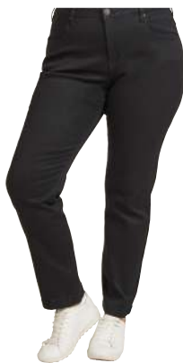
EMILY Curvy Hip Regular Waist Slim Leg