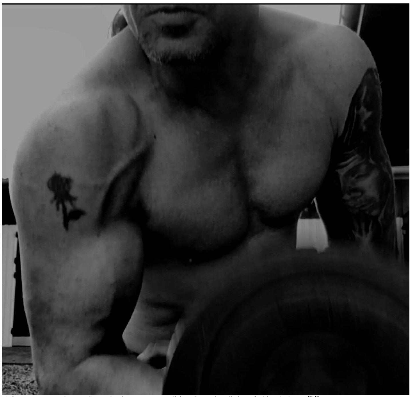
En fin, no pongamos parches antes de que salga el grano y esperemos disfrutar de ese primer día de running/ahogo/agujetas.... 😂 😂