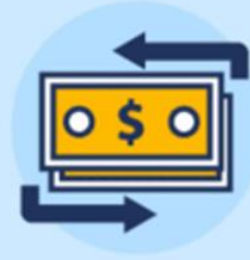
Cash Flow Statement