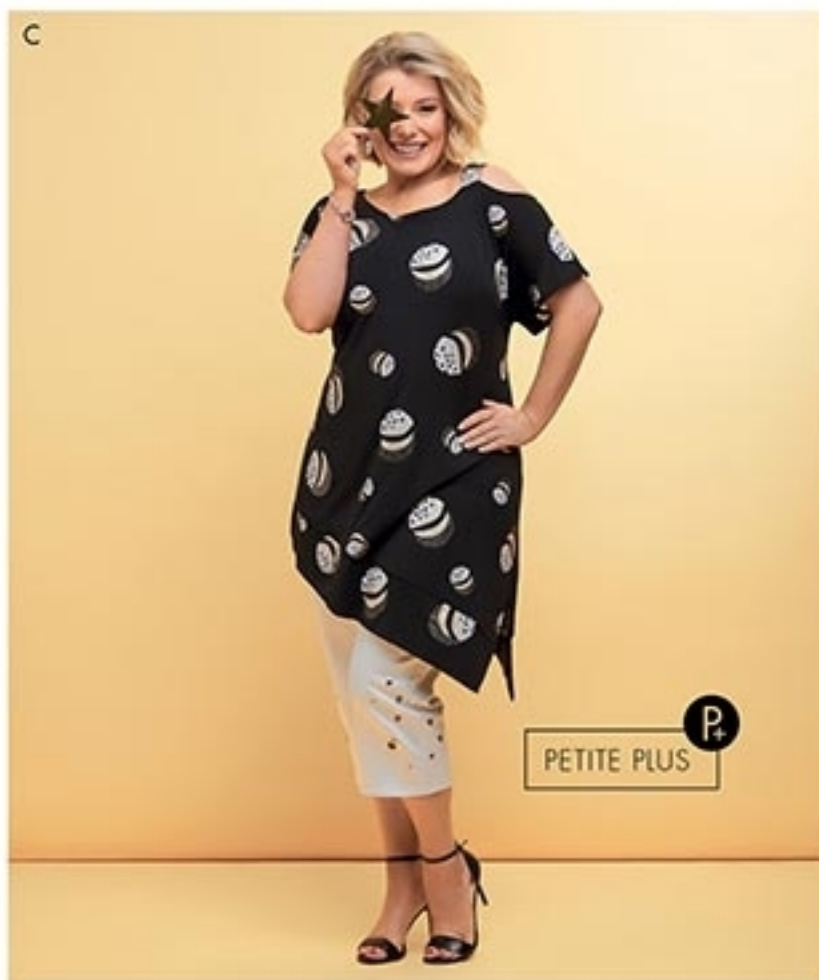
A. Gala Tunic AU$139.95 Crystal Hearts Necklace AU$39.95 Charleston Bracelet AU$24.95 B. Linda Shirt AU$149.95 I Love The Nightlife Tank AU$89.95 You Complete Me Pant AU$139.95 Run Free Earring (Late Nov) AU$14.95 Run Free Bracelet (Late Nov) AU$24.95 C. Petite Golden Girl Tunic AU$119.95 Petite Hot Spot Crop Pant AU$119.95 Stella Earring AU$24.95 Spinning Hearts Bracelet AU$16.95 ® Petite Plus. Designed for women 5'2" (158cm) and under.