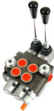
2 Bank D/D Part No. 2bankddd £85.00