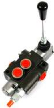
1 Bank D/A Part No. 1bankddd £55.00