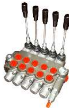
5 Bank D/D/D/D/D Part No. 5 Bank ddddd £185.00