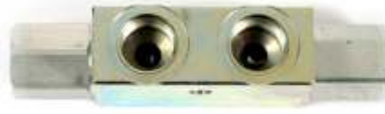
½ " Double Pilot Operated Valves - Pressure Max 300 Part No. Po18650800 £26.55

NEXT DAY DELIVERY GUARANTEED - 1000'S EX-STOCK