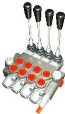
4 Bank D/D/D/D Part No. 4 Bank dddd £140.00