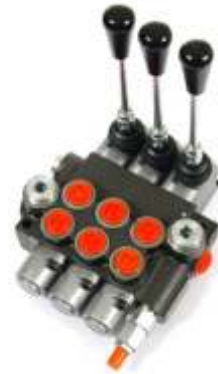
3 Bank D/D/D Part No. 3bankddd £106.00