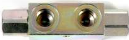
Double Pilot Operated Valves - Pressure Max 350 Part No. PO18650600 £26.55