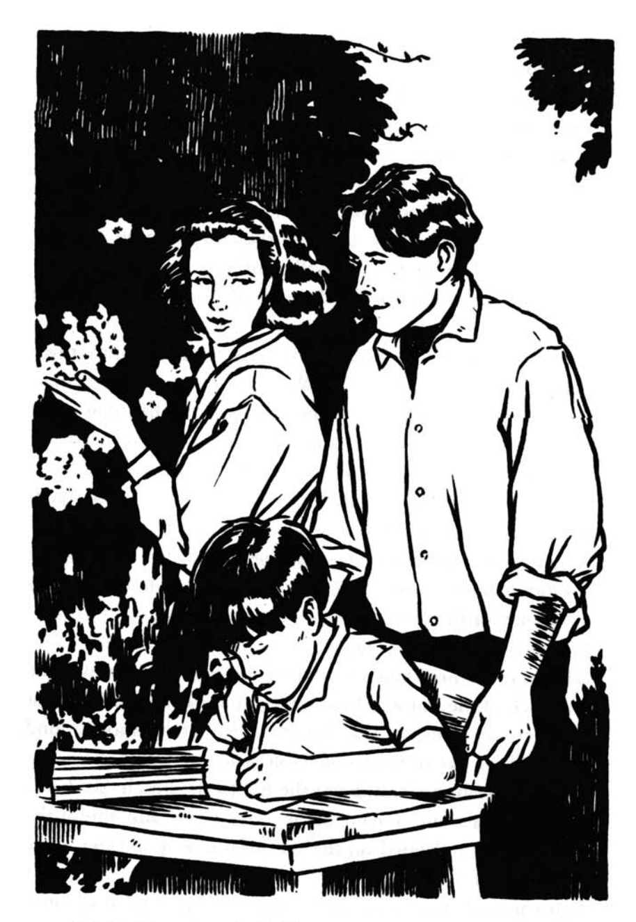
I decided to write a book. Every morning I spent an hour on my story.

'What would you like to give me for my birthday?' I asked.