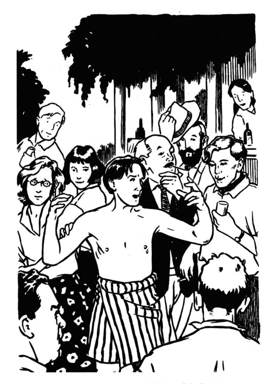
'Snakes!' shouted Leslie. 'The bath is full of snakes.'

'Well,' said Mother quickly, 'lunch is ready.'