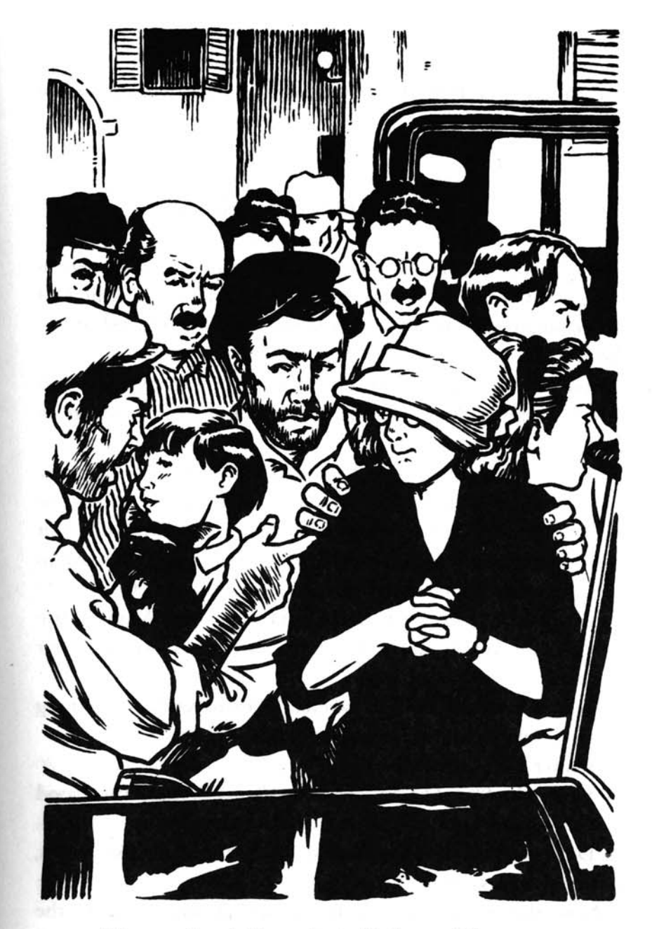
The man thought for a minute. 'Bathrooms? You wants a bathrooms? Get into the car.'

We drove along a little white road through the fields and the trees to the top of a hill, and Spiro suddenly stopped the car. 'Theres you ares,' he said, pointing with a fat finger.