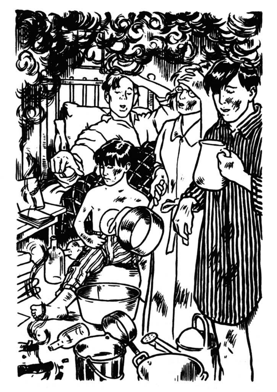
When the fire was out, the room was full of smoke, burnt wood, water and empty bottles.