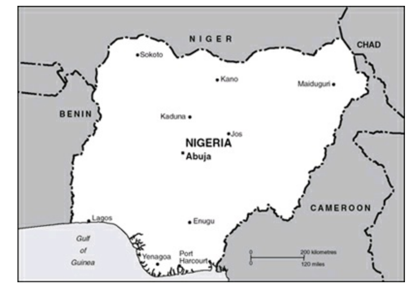
Key cities in Nigeria