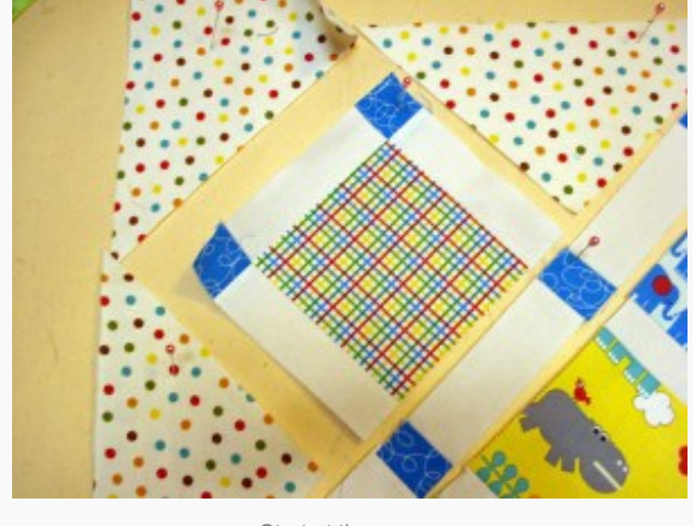
Start at the corner

So much fun to make. But if you don't feel like making one, and want it, I have it for sale on my Etsy Shop. :-) ...and a matching bib/burp cloth set.