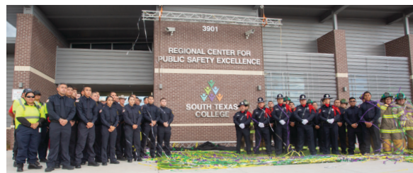
Regional Center for Public Safety Excellence: First Responders, Law Enforcement Officials, and students celebrate the grand opening.

"Keeping communities safe must be our top priority if we are going to have the safety and security to be able to educate our kids, or safety and security to have the vibrant economy that we have. Combatting dangerous threats like those you have to deal with requires superior training for law enforcement professionals, and it's now more important than it has ever been," Abbott said. "You have to deal with issues like human trafficking, gangs and drug smuggling and to do that, it requires collaboration at all levels of law enforcement as well as first responders. Law enforcement officers, firefighters, public safety professionals are essential to that top priority of ensuring security in our state."