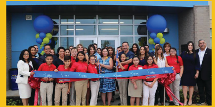
IDEA Owassa 1000 E. Owassa Rd.