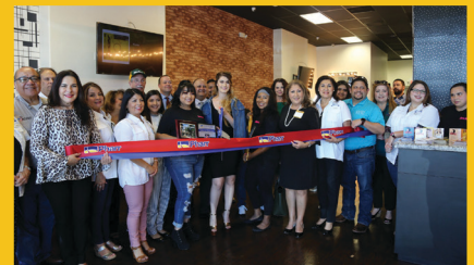
Girl Talk Boutique & Spa 807 S. Jackson Rd., Ste 3