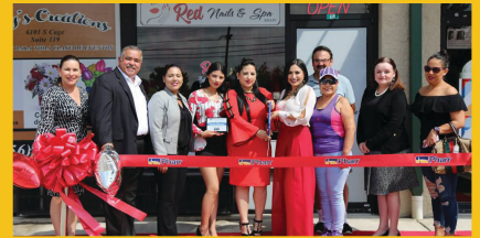
Red Nail Salon & Spa 6101 S. Cage Blvd., Ste 118