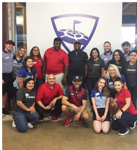
Topgolf Begins Hiring - Topgolf Pharr recently announced that they have started their Mission: Ambition Hiring Event as they seek to fill 350 new jobs in the City of Pharr.

Topgolf has begun their hiring initiatives to fill the 350 openings for the highly anticipated entertainment venue. Pharr EDC in collaboration with Workforce Solutions have been working alongside Topgolf management to accomplish this goal; and with the positive out-pour from our local qualified labor force, Topgolf is just about bridging the gap on all positions. Their hiring events consist of an interactive Topgolf staff meet and greet, followed by a series of informal group rotations to grasp individual strengths without the usual interview jitters. Employees will receive official Topgolf training in preparation for the grand opening, scheduled mid-November.