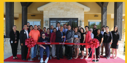
Colonial Manor Celebrates One Year Anniversary 1100 W. Minnesota Rd.