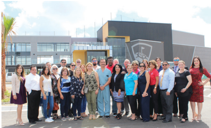
Guests were treated to an exclusive tour of Topgolf, Pharr's newest entertainment venue.

Various commercial brokers, real estate agents and guests attended the first Pharr Commercial Property tour to receive an insight on available commercial sites. Properties, both vacant and developed throughout the city of Pharr were showcased for potential investment opportunities. The tour ended with an exclusive stop at the acclaimed global sports and entertainment venue, Topgolf, for an opportunity to meet with management and receive finalized project specs. Guests received a complimentary lunch presentation on the benefits of opportunity zone investing sponsored by BBVA Compass, SAMES, Inc., Valley Land Title Co., VTX1, and Credit Solutions.