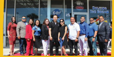
10°F HUT PHARR ROLLING ICE 500 N. Jackson Rd., Ste K1