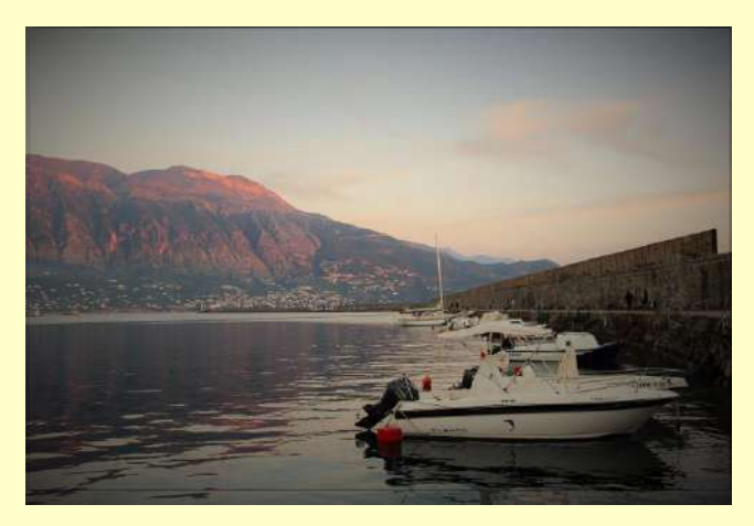
http://en.wikipedia.org/wiki/Kalamata http://www.visitgreece.gr/en/main cities/kalamata

At the links below you will find some information about the town and the area, you will be able to see some pictures but unfortunately some texts are in Greek: