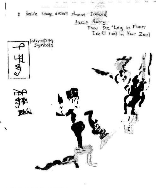
Leg in Moon the Ice Shaman

reader with a kind of awe, turn the picture upside down and examine it again. Suddenly, what appeared to be a Flame Angel now emerges as a Sorcerer flinging a fireball toward the observer, surrounded at each of the cardinal points by large flames. Above his head, the sorcerer appears to have opened a rift exposing a star populated portion of deep space!