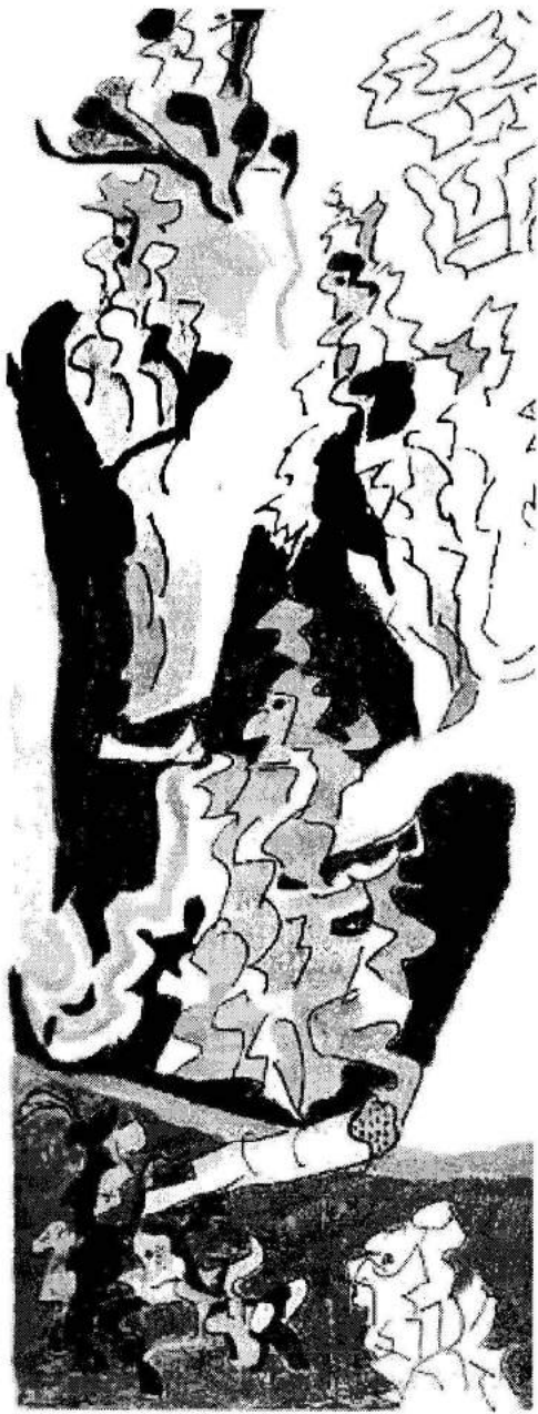
Peering Into the Past