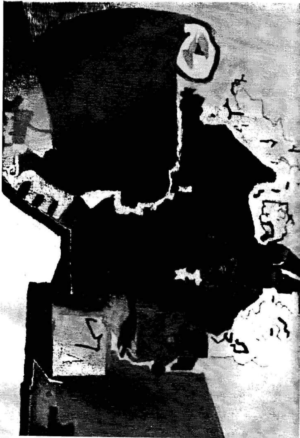
The Salvation of a Controlbot