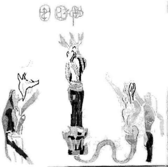
Sabbath of the Succubus

Below are two examples of spirits evoked utilizing automatic drawing technique. The second drawing will be discussed at length momentarily, but for the moment take note of how each of the drawings consist of outlined figures, not detailed images. Greater detail can be added after an artist has developed some skill with the automatic painting process.