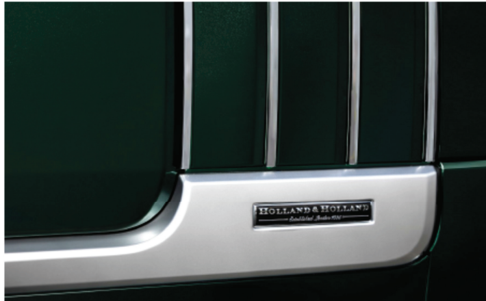
European model shown