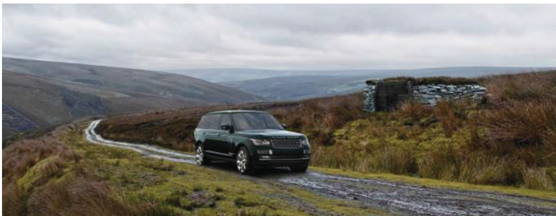
European model shown