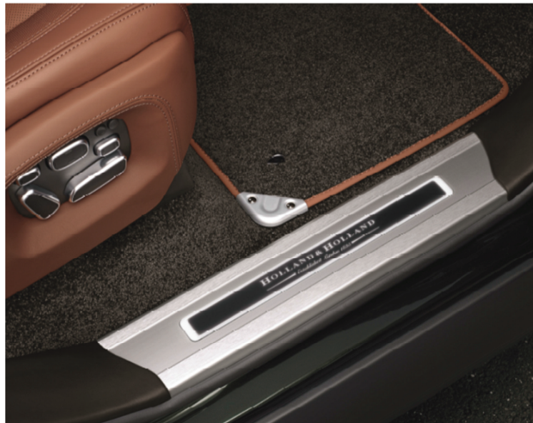
European model shown (Right Hand Drive Model)