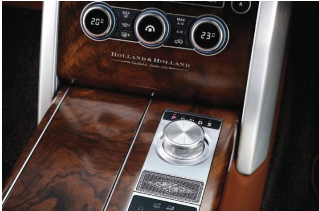
European model shown (Right Hand Drive Model)