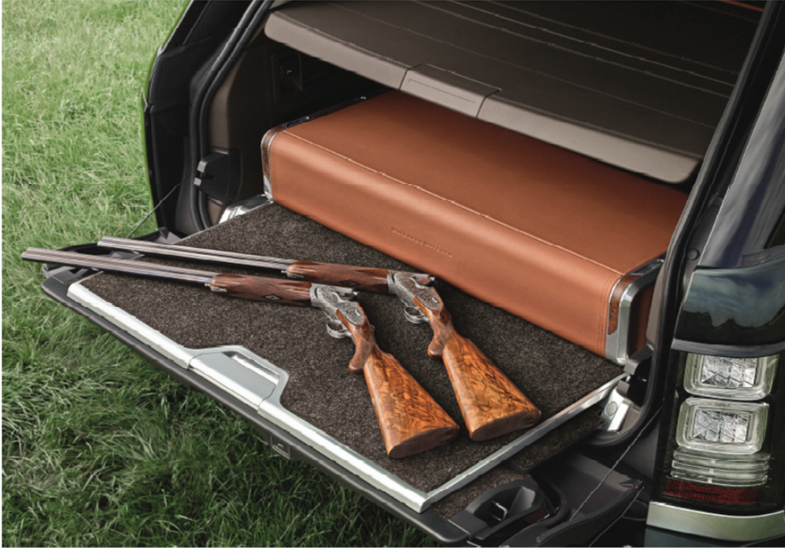
European model shown