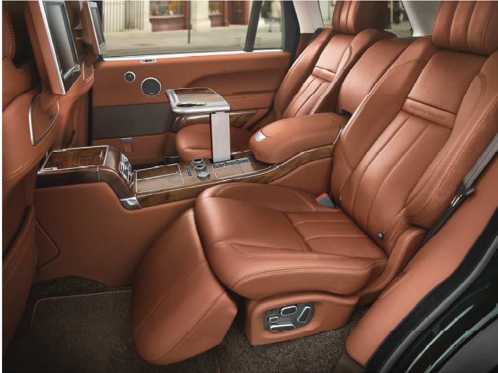
European model shown (Right Hand Drive Model)