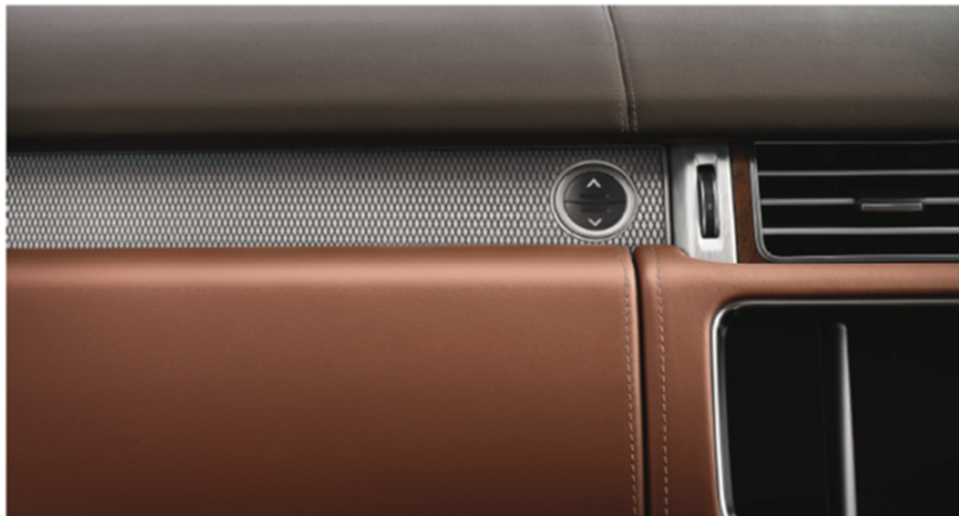
European model shown (Right Hand Drive Model)