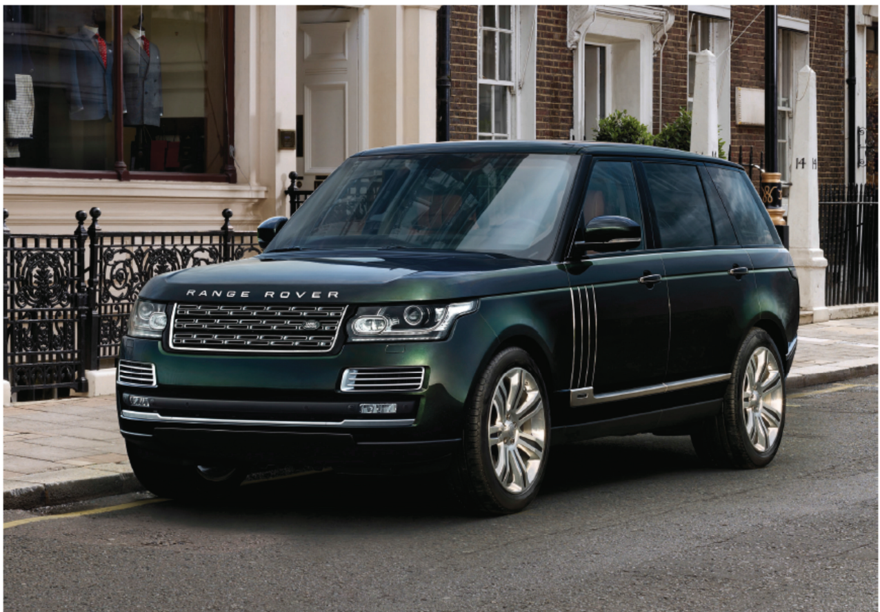
European model shown

Jaguar Land Rover North America, LLC is pleased to announce the introduction of the Holland & Holland Range Rover for 16MY. This exclusive Range Rover will be available in very limited volume. Sales are expected to commence during the first quarter of 2016.