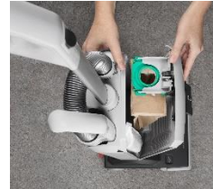
Easy change of filter bags