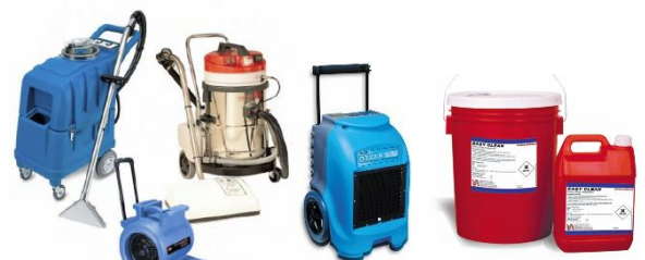
TYPHOON Carpet Extraction Machines, Blowers & Dehumidifier