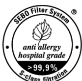
S-Class Filtration Logo