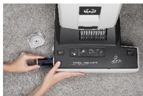
Convenient brush replacement