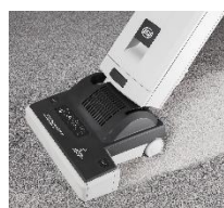
Automatic brush height adjustment