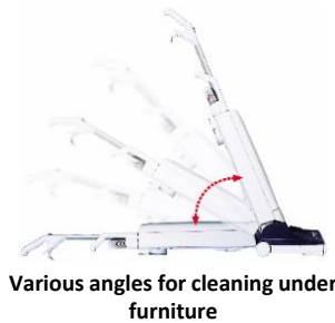
Various angles for cleaning under furniture