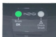
Electronic Brush Monitoring & Motor Protection