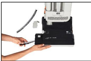
Easy brush strip change, without the use of tools