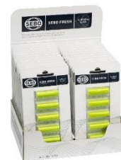
Citrus Fresh air freshener capsules can be used to emit a clean and fresh aroma as you vacuum