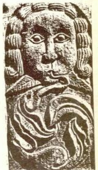
THIS ILLUSTRATION shows a detailed carving from an almost 300-year-old gravestone at Phipps Street Burying Ground.