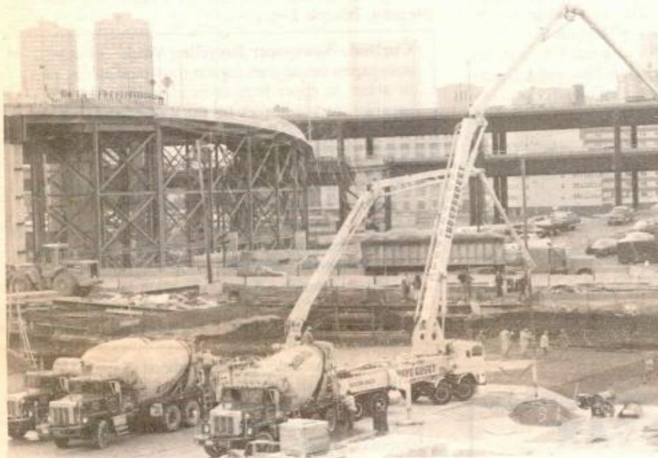
CANA TUNNELS connecting City Square to Routes 1-93 and 1 were capped off last week with 2,000-cubic-yards of concrete, marking the last large concrete pour on the Cen-