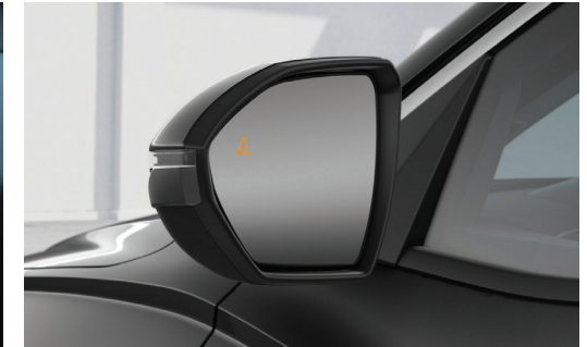
Blind Spot Detection