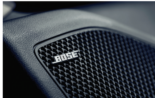
Bose Premium Audio