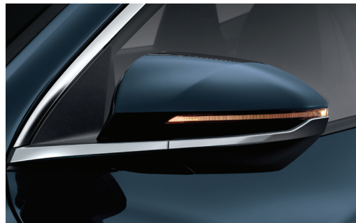
Outside mirror LED repeaters