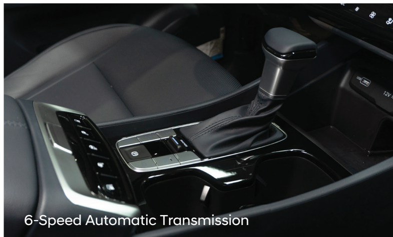
6-Speed Automatic Transmission