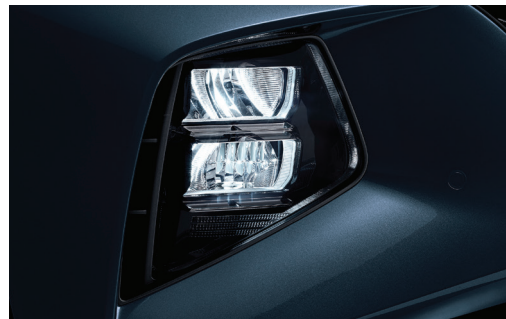
MFR LED headlamps