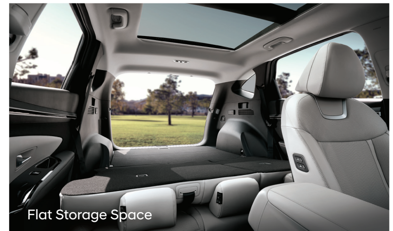
Flat Storage Space