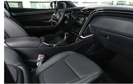
Leather Seat Drak Blue Interior