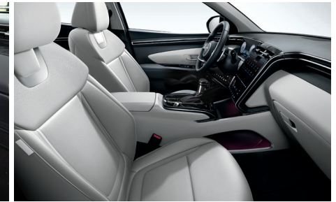
Leather White Interior