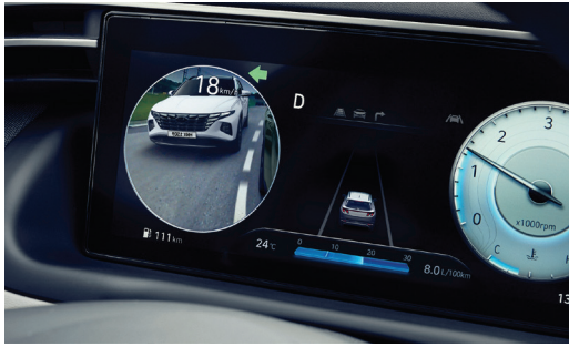
Blind Spot View Monitor with 10.25" Open Cluster