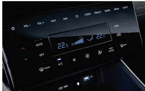
Full auto air conditioning system