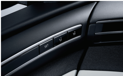
Integrated memory system (IMS)