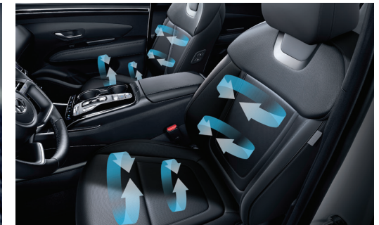
Ventilated front seats