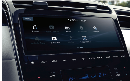
10.25" LCD Touch Screen