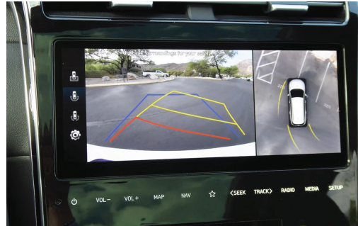
Surround View Monitor 4 HD cameras mounted (360°)