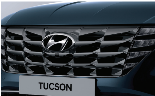
Dark black chrome radiator grille