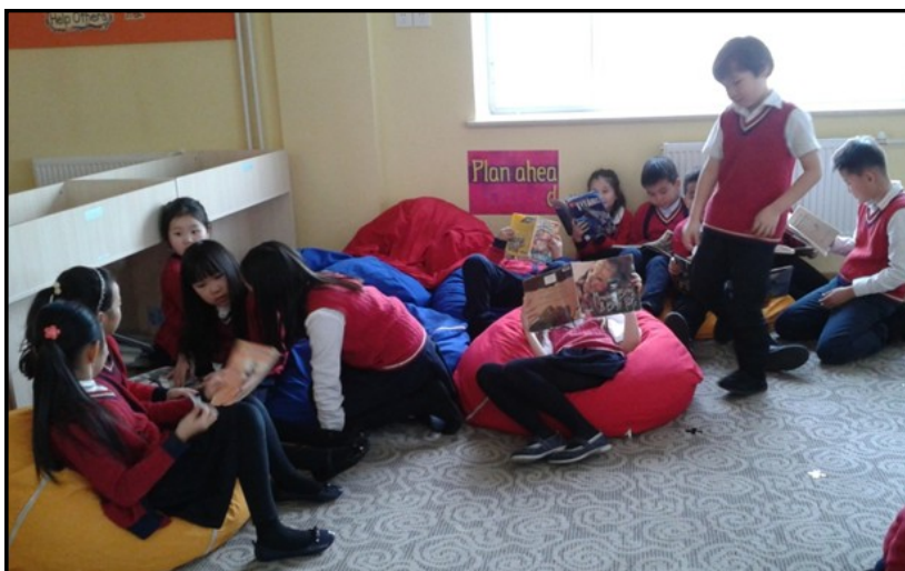
Grade 3 students learn to enjoy the adventure of reading.

If your child has lost a book, please speak with me yourself or send older students to speak with me for themselves. There are several options when a book is lost: replace the book with a new copy of the same book, or pay for a replacement book. Often the lost book will turn up in the classroom, the backpack, the car, or the bedroom. Students should develop their responsibility by taking good care of their be-