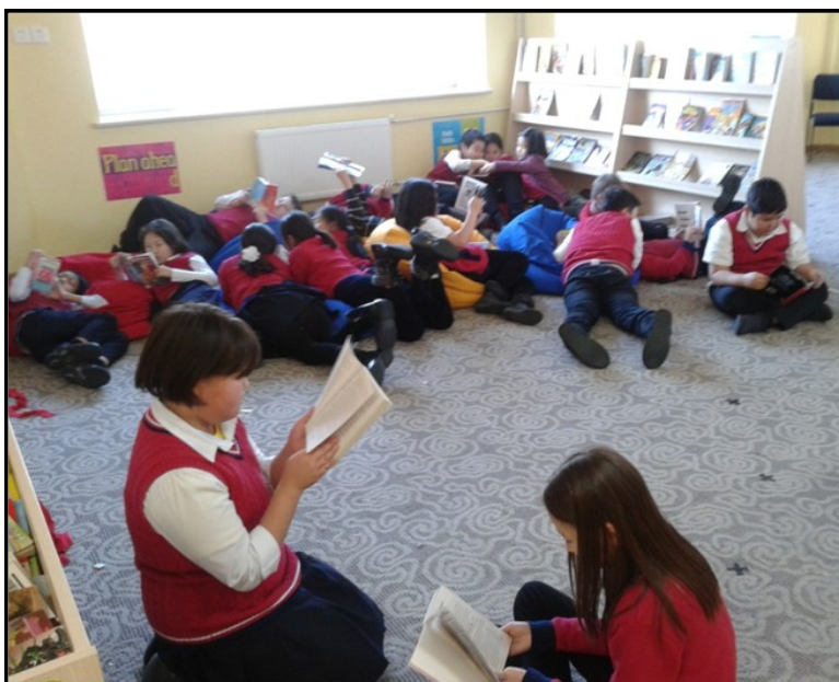
Students relax in the library with a good book.

Throughout the rest of the school year, we will apply the skills we have practiced to help us learn about lots of different topics. The Library is a great place to learn, and also to play. As students grow, they will need the Library for many learning opportunities. This year in the Library, we are beginning to see