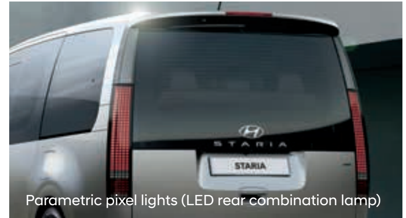
Parametric pixel lights (LED rear combination lamp)