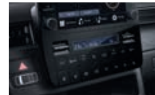
Full-auto air conditioning system