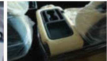
One small seat & Cup holder