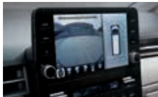
360 view monitor