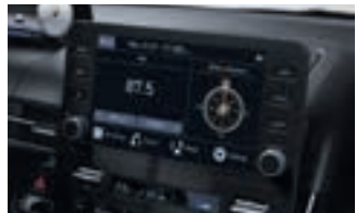
8" display audio