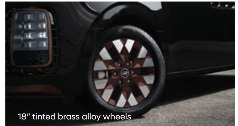
18" tinted brass alloy wheels