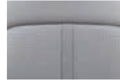
Nappa Leather (Lounge)