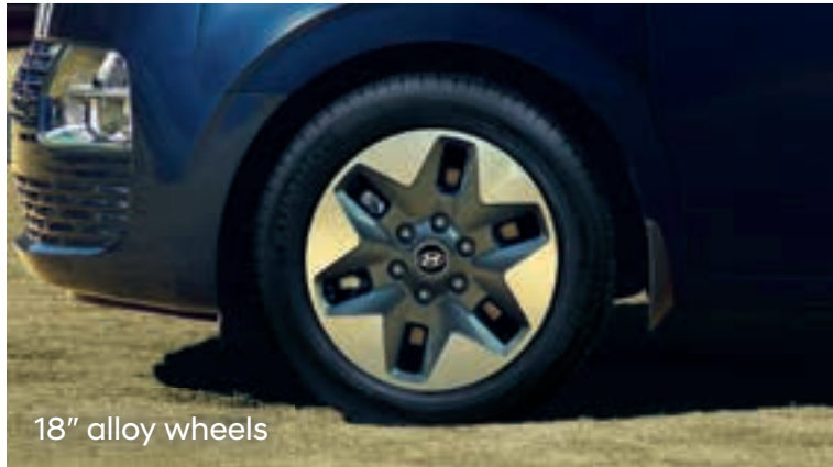
18" alloy wheels

From the moment you first lay eyes on STARIA, you know it stands in a class of its own. It's not imitative or derivative but a truly original creation—the product of inspired design. Inside, you're greeted by a spacious, wide-open cabin that flourishes with premium touches like the digital gauge cluster and elegant materials that feel so soft to the touch and are always easy on the eyes.