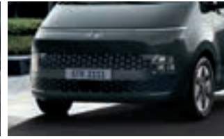
Grille with headlamp