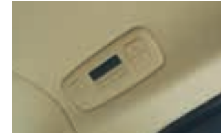
2nd row roof Air-con controller