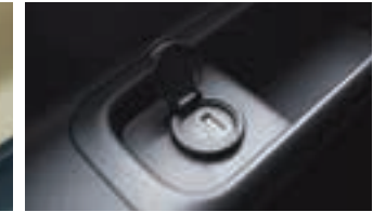
USB outlets at all seats