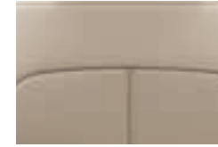
Genuine & Artificial Leather (Premium & Deluxe)