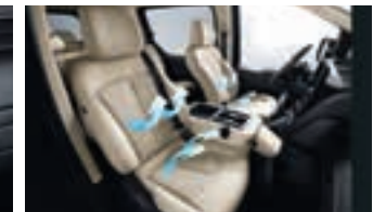
1st-row ventilated seats