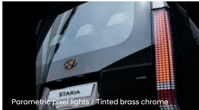
Parametric pixel lights / Tinted brass chrome