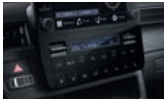
Full-auto air conditioning system