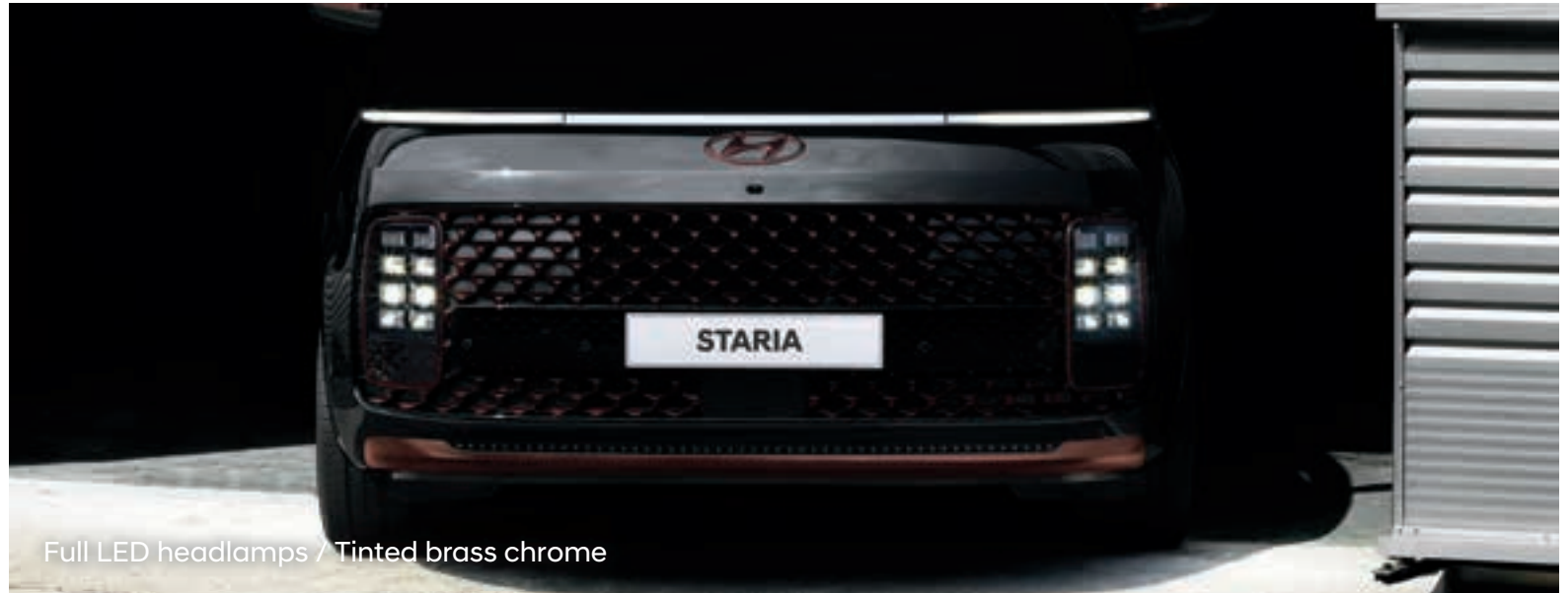
Full LED headlamps / Tinted brass chrome