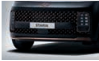
Tinted brass chrome bumper