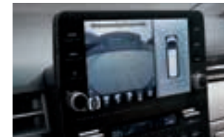
360 view monitor