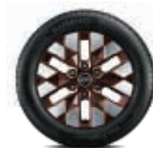
STARIA Lounge 18" tinted brass