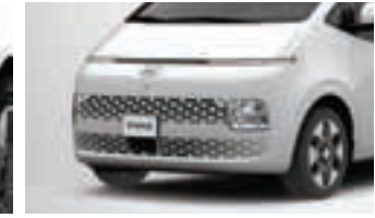
Grille with headlamp