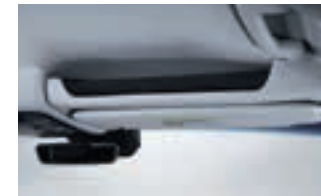
Front roof with pocket