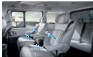
2nd-row ventilated seats