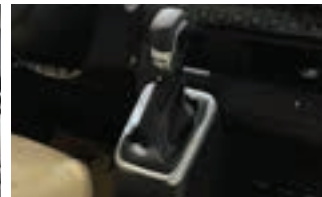
8 speed automatic