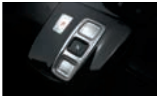
E-Shift 8 speed automatic