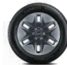
STARIA Premium and Deluxe 18"