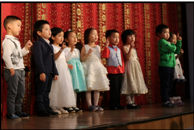
Pre-K students perform "One Little Finger."

struments, assessments for lower primary grades students, and tests for upper primary grade students.