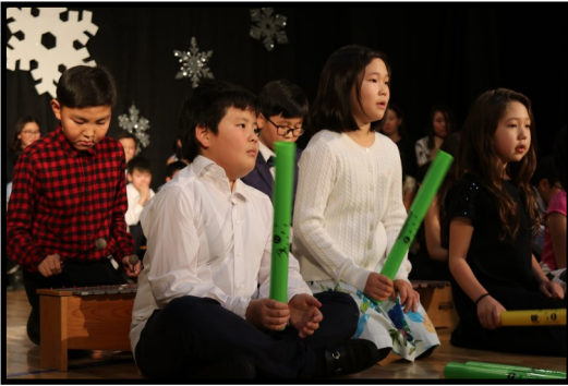
Students demonstrated their talents on xylophones and boomwhackers (above), violins (top right), recorders (below) and more during the annual concert.

Our students started preparing for the winter concert in September, for this year we had our music concert in December. It has been a hard and long work spanning over three whole