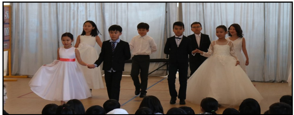
Students from the Dance After School Activity perform during the November Spirit Day Assembly. The crowd was treated to two dances, the first to "Once Upon a December" from the movie Anastasia and the second to Tchaikovsky's "Waltz of the Flowers."