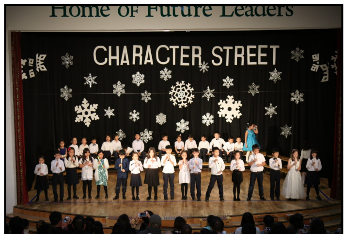
Grade 5 performs a few songs from the musical, "Character Street," featuring themes of respect and responsibility.