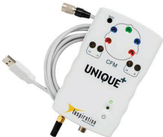
Unique+ CFM headbox