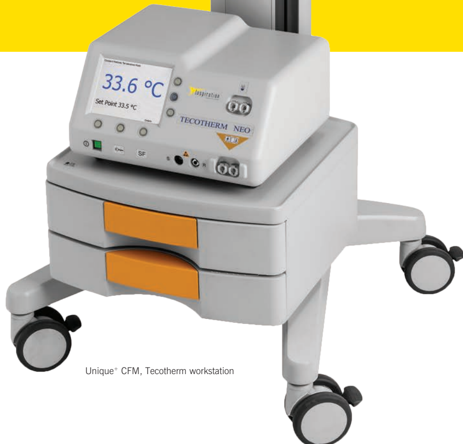
Unique+ CFM, Tecotherm workstation