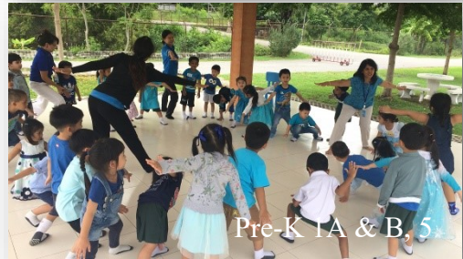
Pre-K 1A & B, 5