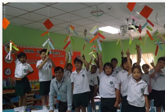
Grade 2 Trail Blazers' Wish Kites "If only our wishes could come true!"