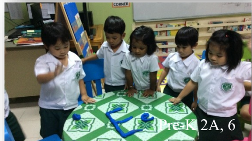
Pre-K 2A, 6