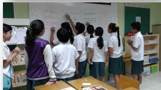
Group activities bring more fun to learning in Grade 6 classroom.