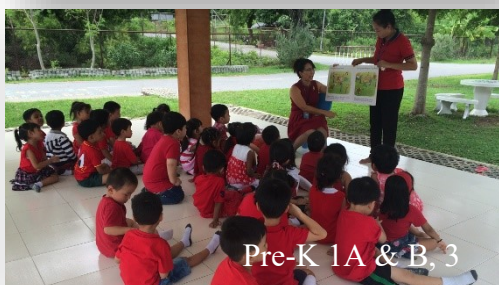
Pre-K 1A & B, 3