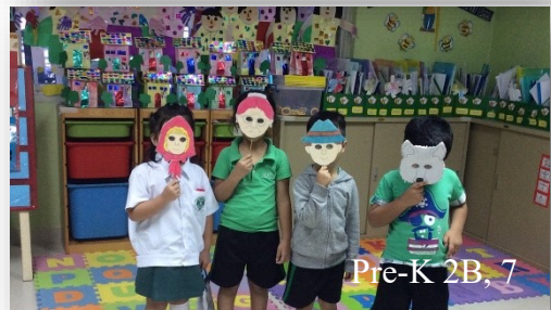
Pre-K 2B, 7