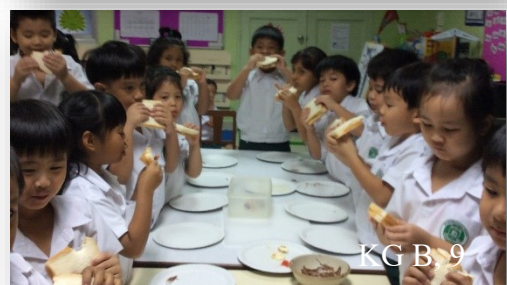
KG B, 9