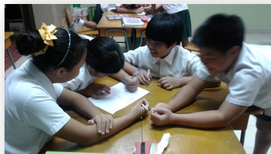
Group activities bring more fun to learning in Grade 6 classroom.