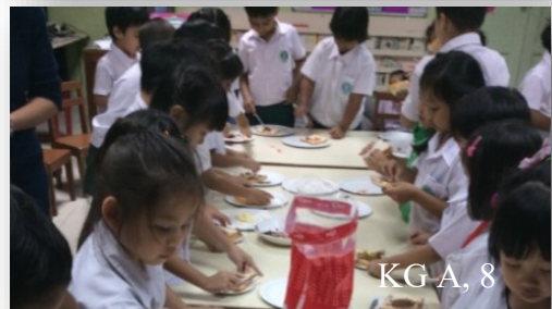
KG A, 8