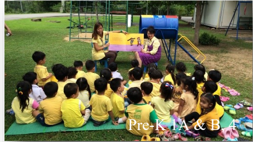
Pre-K 1A & B, 4