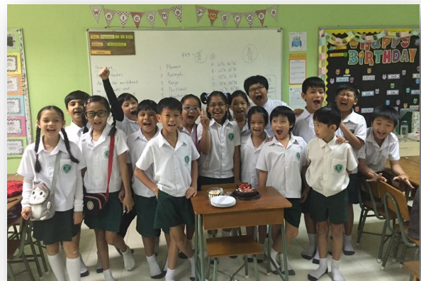
Grade 3 Bright Owls busy with their classroom activities