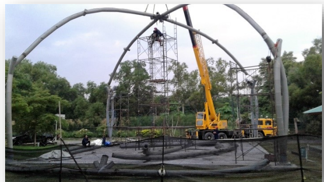
PE/Assembly Pavilion Under Construction