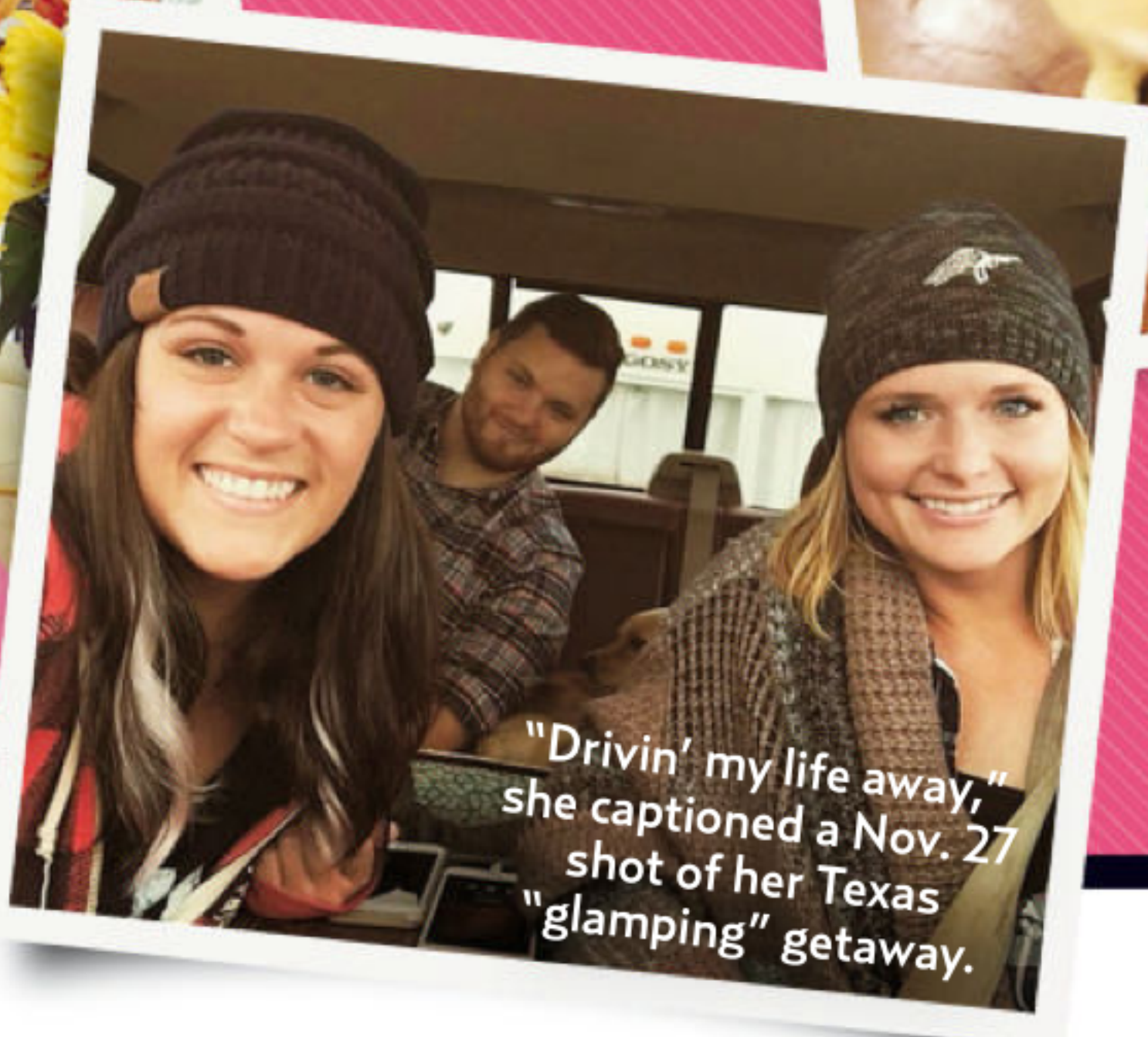
“Drivin’ my life away,” she captioned a Nov. 27 shot of her Texas “glamping” getaway.