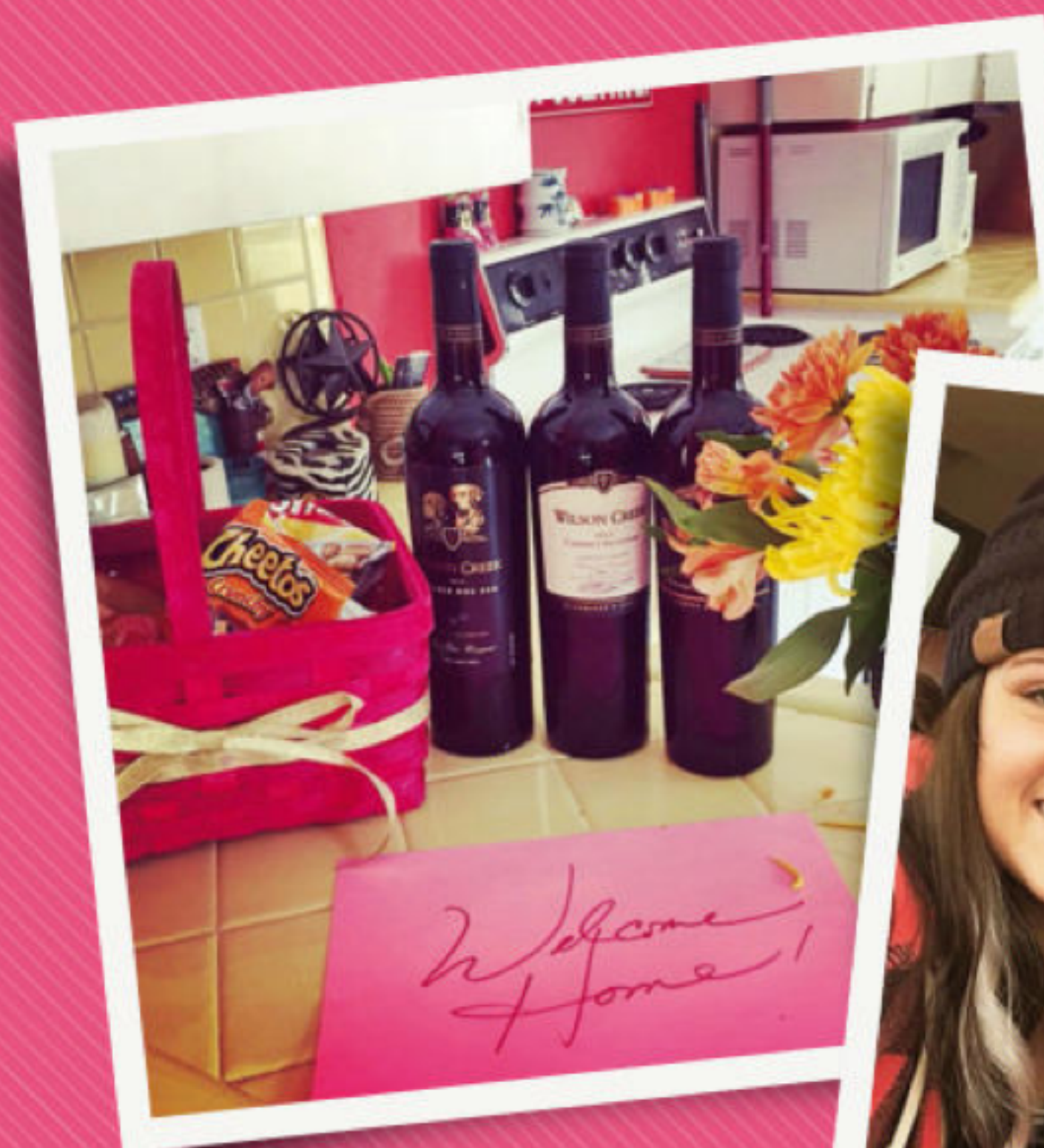
A wine and Cheetos-filled welcome from Mom greeted her in Texas Nov. 25.

Lambert posts her single life on Instagram