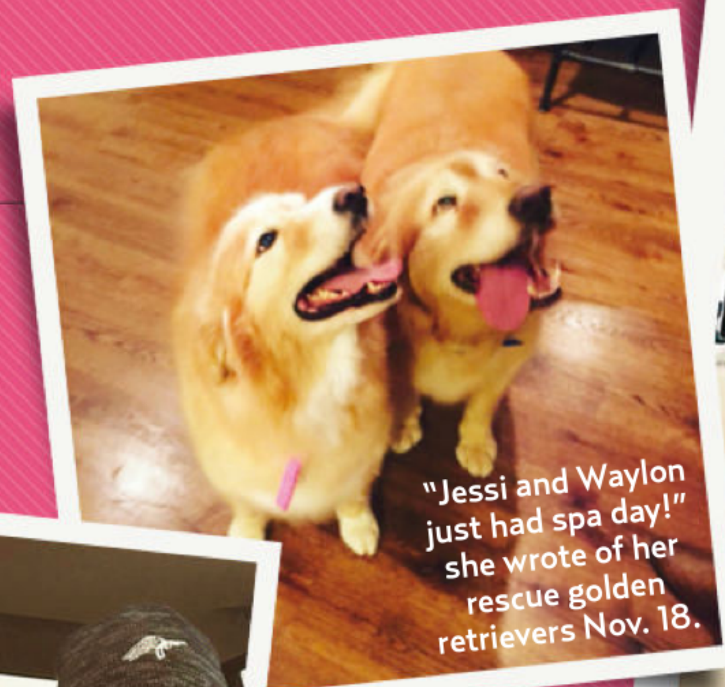
“Jessi and Waylon just had spa day!” she wrote of her rescue golden retrievers Nov. 18.