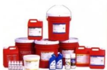
Professional Cleaning Chemicals