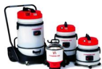
Typhoon Wet/Dry Vacuum Cleaners