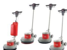
Cyclone Single Disc Floor Machines