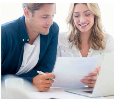
Share with partner