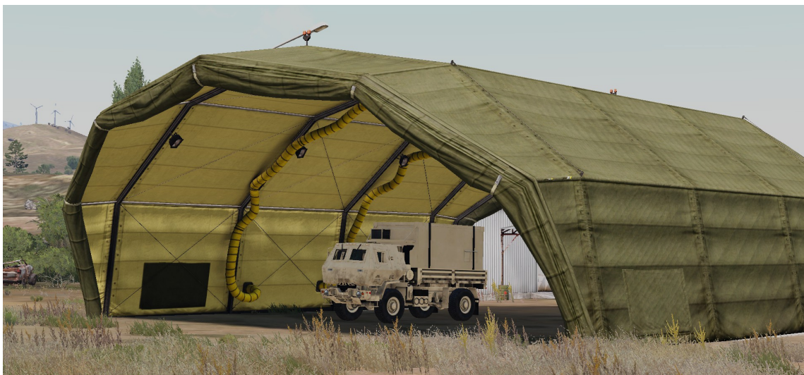
NATO command vehicle

Intel: Destroy the command vehicle or prevent NATO forces to reach Pyrgos (port) before h1145.