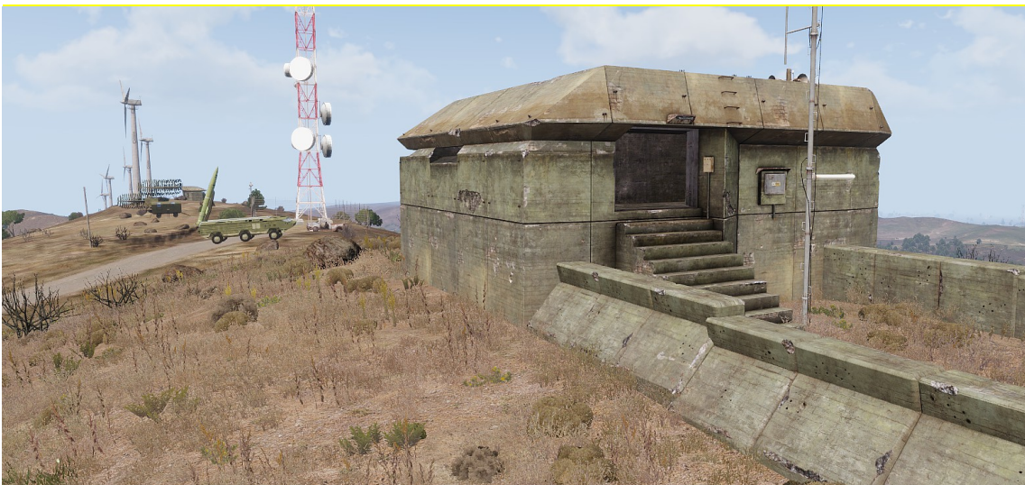
Missile test area

Intel: Activation codes available in "Mission Task", once gathered in Telos base; ACE interaction on laptop (at the missile test area), select "deploy missile" (wait for missile deployment), select "Insert code to launch/abort", and type the activation code.