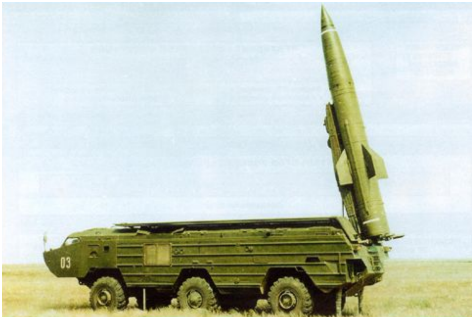
Czeck OTR-21 "Tochka"

Few hours ago, a NATO task force took control of Telos city and got in contact with a secret agent, who stole the missile activation codes. NATO HQ is sending reinforces to extract the agent and his laptop.