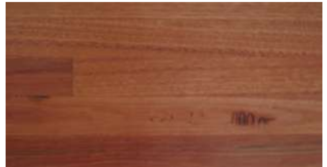
Medium Feature Bluegum

High Feature has the higher ratio of features allowed within the standards on each board. Permissible features include knots, holes, tight and loose gum veins, limited gum pocket and checks.