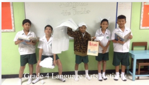
Grade 4 Language Arts Activity