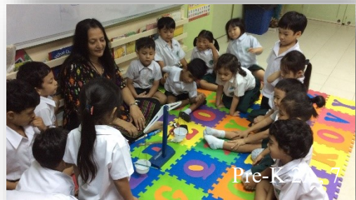
Pre-K 2A, 7