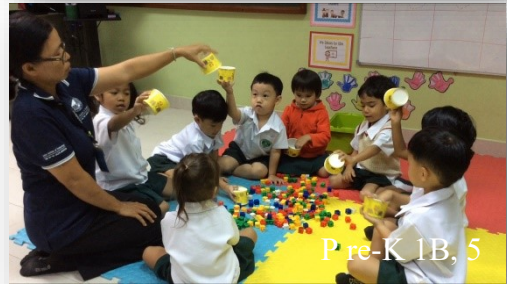
Pre-K 1B, 5