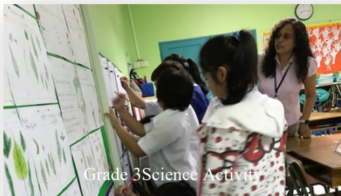
Grade 3 Science Activity