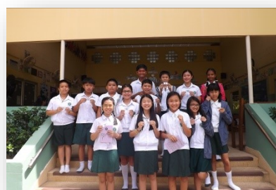
We are 'Book Lovers'!

Grade 6 students with their first 2017 Joy of Reading Tags