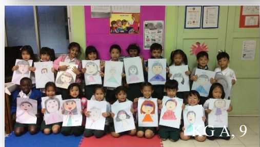
KG A, 9