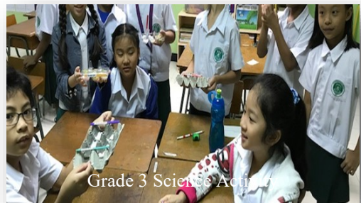
Grade 3 Science Activity