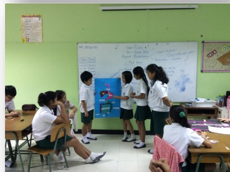
G-5 Ace Achievers' Science and Social Studies Activities