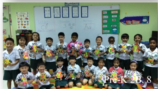
Pre-K 2B, 8