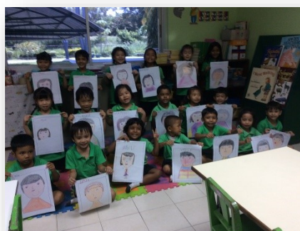
The KG B children drew and colored a portrait of themselves for the topic Me, Myself and I.