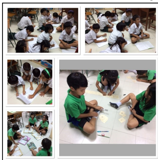
Grade 2 Eager Beavers' Language Arts and Math Activities