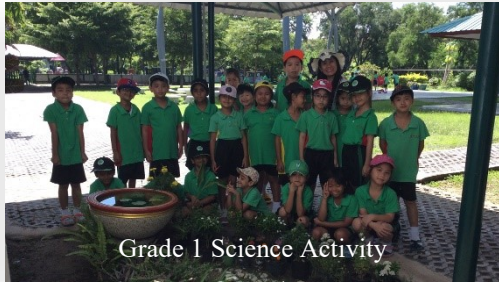
Grade 1 Science Activity