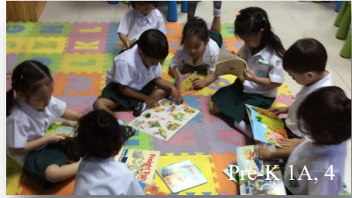
Pre-K 1A, 4