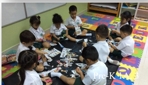
Pre-K 1A, 3