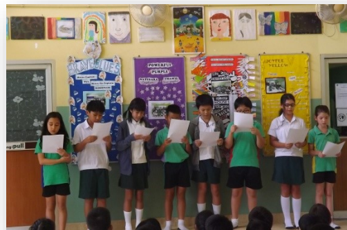
Oath-Taking by House Captains/Vice Captains