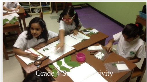
Grade 4 Science Activity