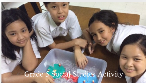
Grade 5 Social Studies Activity