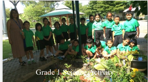
Grade 1 Science Activity