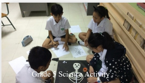
Grade 5 Science Activity