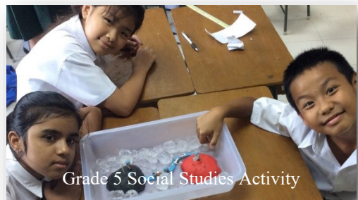
Grade 5 Social Studies Activity