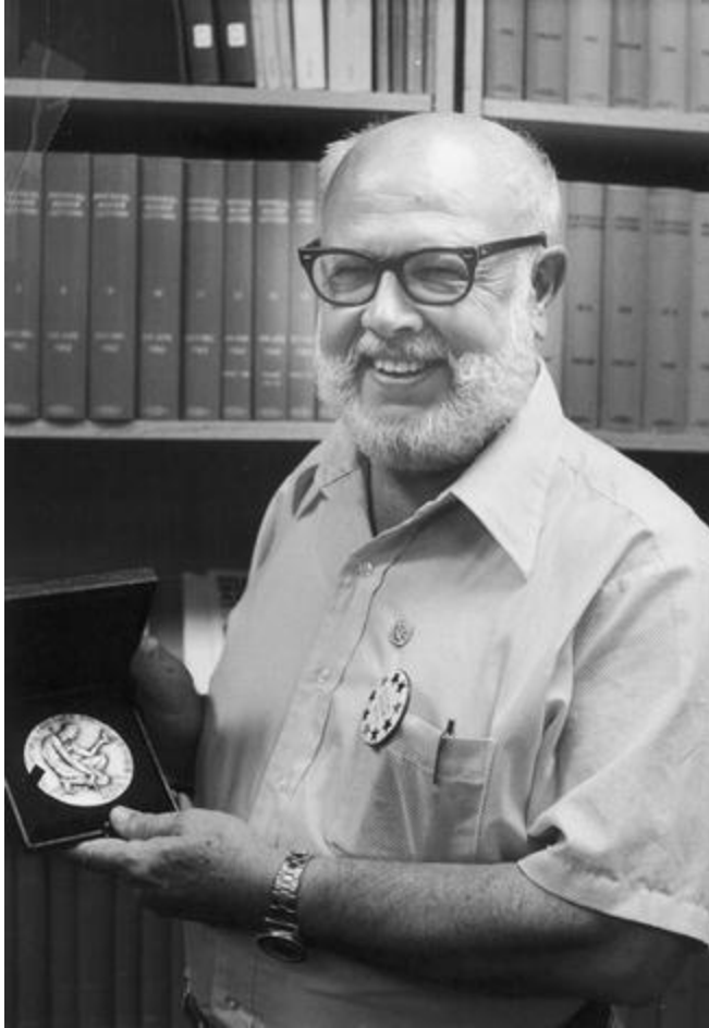
Fowler, William Alfred. (Fowler holding the National Medal of Science)

The scientific career of William Fowler has enduringly enriched astronomy by providing a systematic treatment of nuclear reaction rates in stars. This achievement earned him the 1983 Nobel Prize in Physics, shared with Subrahmanyan Chandrasekhar.