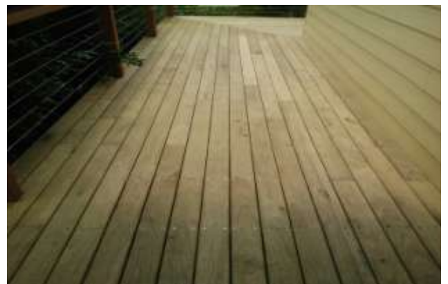
Tallowwood Feature Grade

Feature - This grade allows a high level of natural features, including gum veins, insect markings, surface checks and small knots and other natural imperfections, while at the same time maintaining durability and structural performance. It will often be supplied with shorter length material that has a minimum length of 1.5m.