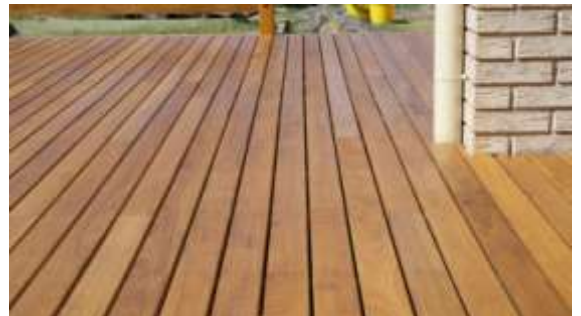
Tallowwood Standard & Better Deck

Tallowwood ( Eucalyptus microcorys ) is a naturally oily wood with a high tannin content. It is a greyish-yellow colour with tinges of olive green and is a hard, fairly close-grained timber. The timber is free of gum vein, something quite rare in eucalypts.