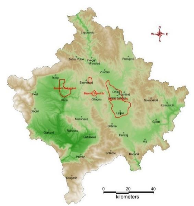
Fig. 1. Coal basins in Kosovo

Lignite utilization in Kosovo's basins has come up to the environmental changes that are reflected on nature with new forms of anthropogenic landforms, such as the creation of pit holes from the expansion of existing mines and the opening of new mines, ash hills; thermal effects in the environment, pollution of water, air, soil, etc.