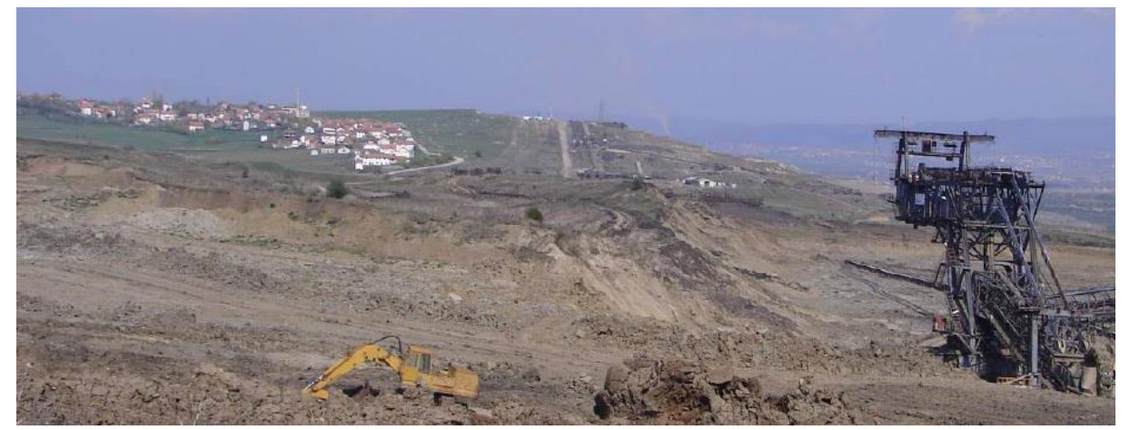
Fig. 4. Hade, a settlement that should displaced for coal mining

According to other data (Ministry of Energy and Mines, 2009), it is said that the existing two mines of Bardh and Mirash have spent the total coal reserves of 300 million tons. While, in 2012, Mirash and Bardh mines were merged and on this occasion the coal mines were exhausted. With existing mines exhausted, the works on coal Power plants will continue towards the north, where the new mine "New Mining Field" will be opened. Finally, during the 5th century of lignite exploitation, with an average production of 5.5 million tons, 400 million m3 of overburden material and 54 million m3 of coal ash has been dislodged (Fig.3 and 4)