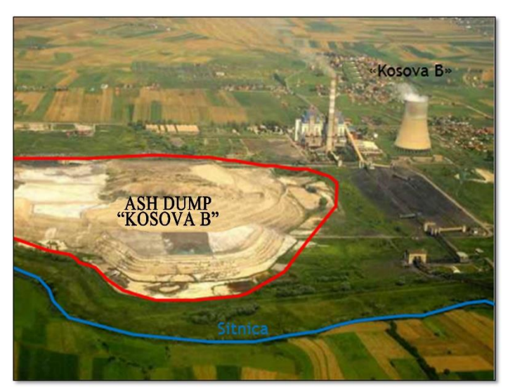
Fig.6. Ash dumps of Power plant "Kosovo B" along Sitnica River

(D – Density, N – number of object, S – area).