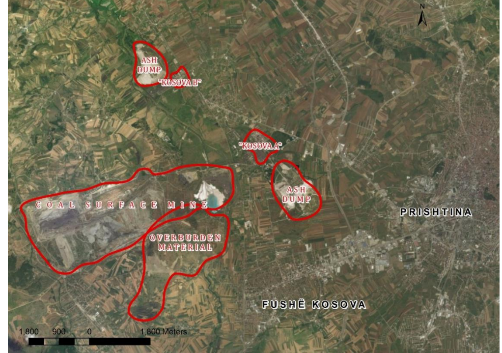
Fig. 3. Power plants, existing mines and distance from urban centers

Out of the amount of coal exploited, approximately 90% are used for electricity generation, 7% for chemical processing and about 3% for industry and households. In the period 1958-1996, a total of 208,222,306 tons of coal and 29,158,083 m3 of overburden materials were produced in two surface mines. During this period, 1.81% of Kosovo's total exploitable reserves or 2.12% of coal reserves in Kosovo were exploited. (Abazi, 2000)