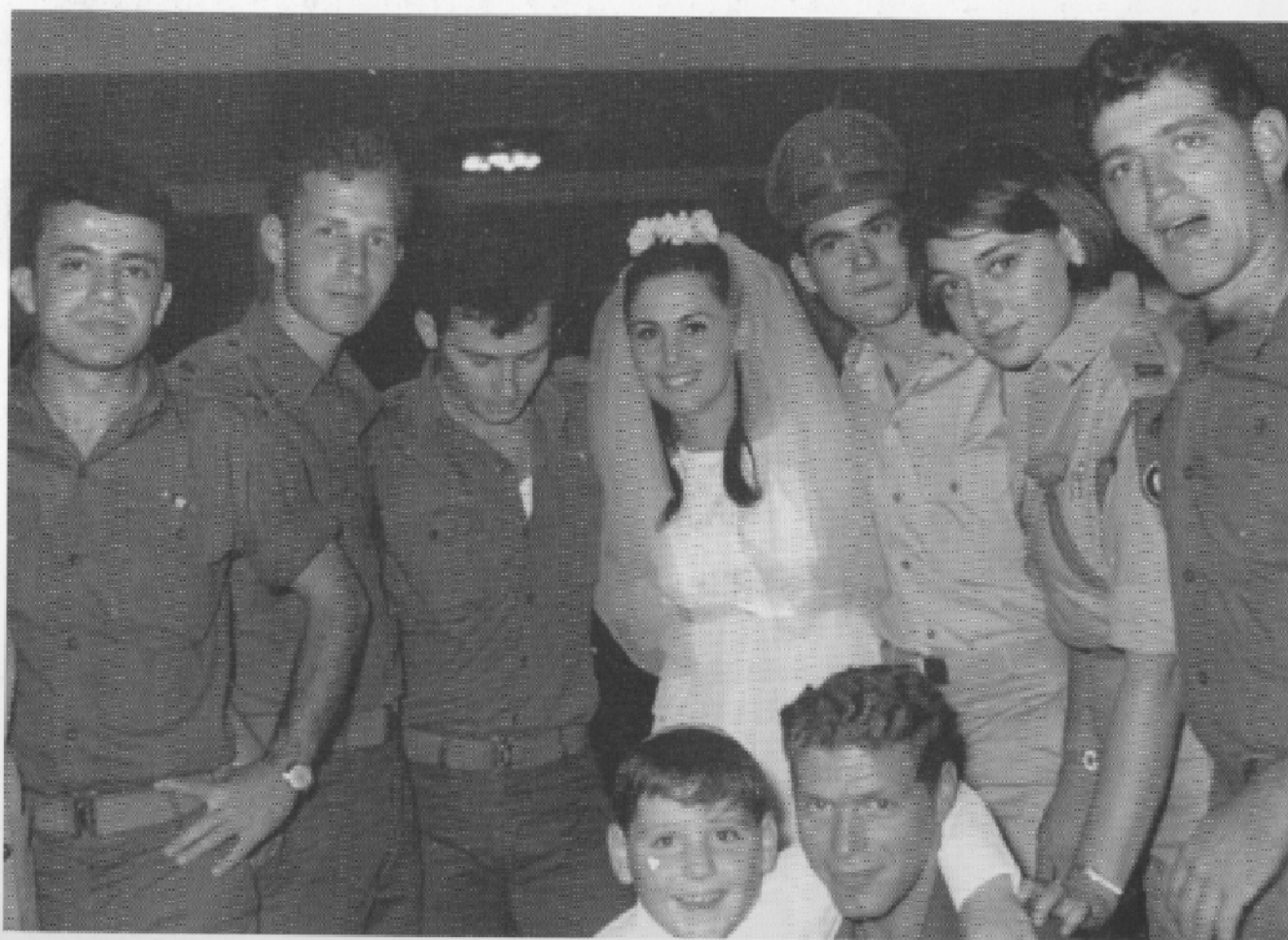
At my wedding, surrounded by fellow officers from the military police.