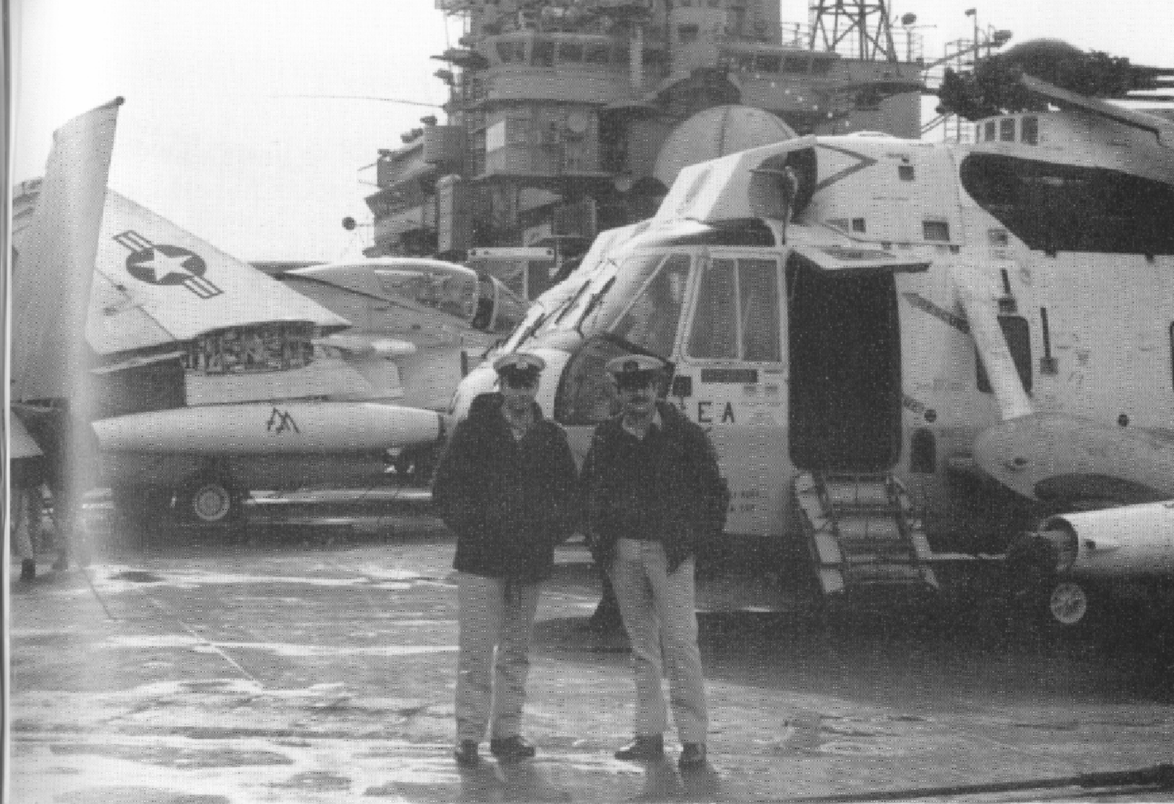
Standing on an American aircraft carrier docked in the port of Haifa, 1981. Because I could speak English fluently, I often served as a liaison to American ships.