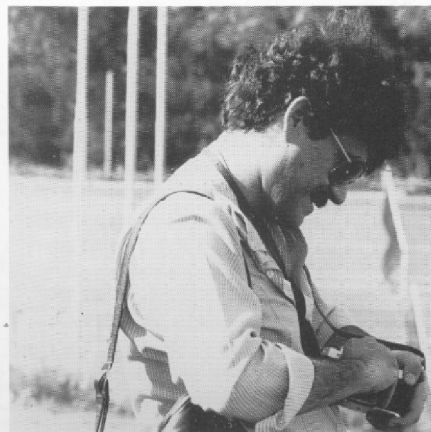
Stopping to load a camera while in the midst of a Mossad photography exercise.