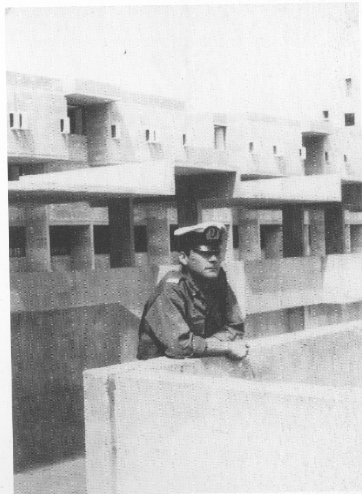
Outside the officers' school in Mitspeh Ramon, 1968. I'd just turned eighteen and looked forward to a long military career.