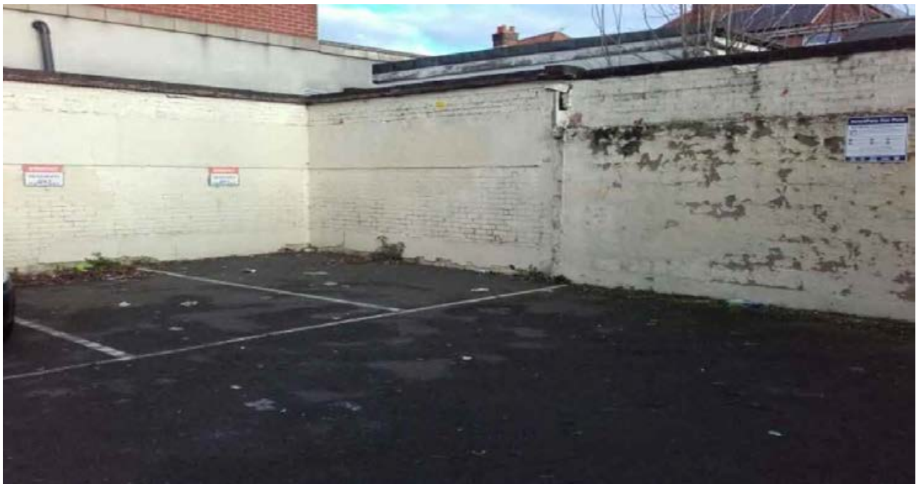
Photograph above showing the resident bays. Please note our signage clearly advising Non Vets4Pets customers will received a PCN.