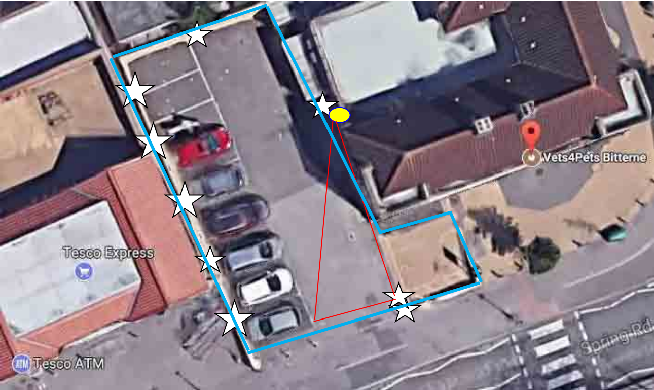
Site map showing signage and the ANPR camera with the read area As shown above, highlighted by the blue line, this whole car park is for Vets4Pets customers only.