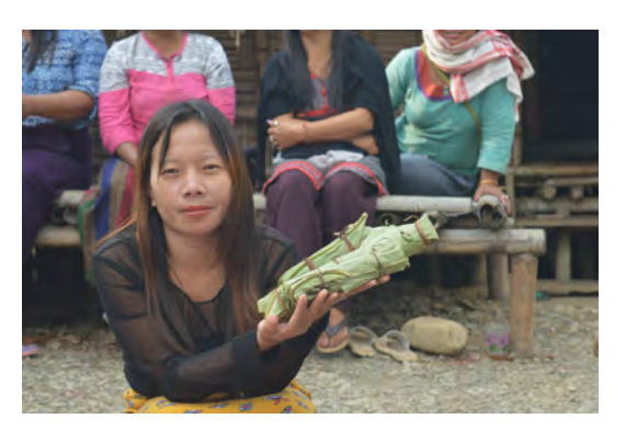
Figure 8 A Nocte girl displaying traditional salt packets.