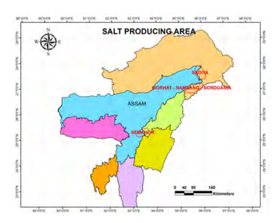
Figure 1 The map showing three salt producing villages of Assam.