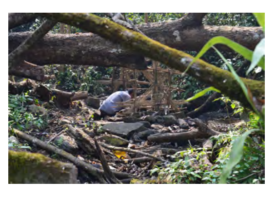
Figure 6 Semkhor Well.