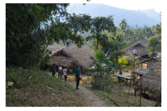
Figure 5 Khela, the last salt producing village of Mohong.