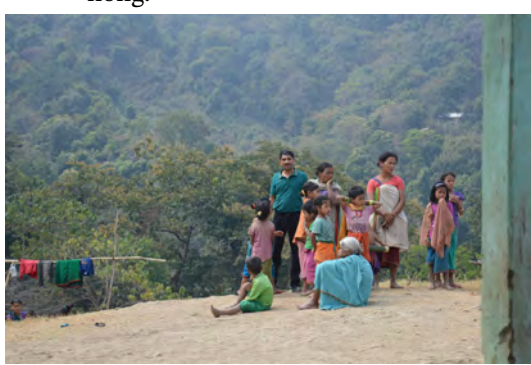
Figure 7 Semsa People (Photograph by author).