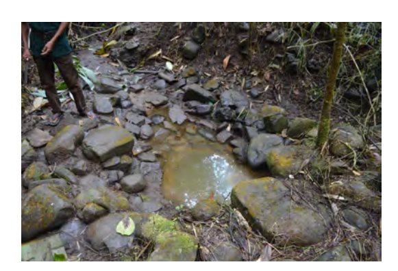
Figure 4 Khela Well.