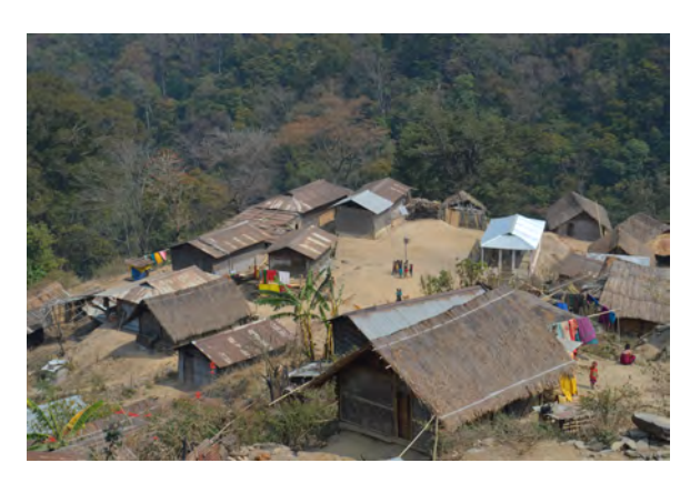
Figure 2 Semkhor Village.

known to be the first tribes to produce salt from Mohong area. Such salt productions practices were before the advent of the Ahoms in 1228 CE and the Nagas. When the Ahoms occupied the Dimāsā territory, they engaged some Dimāsā people for salt extraction. There are six groups Kachāri origin people residing in the salt producing area of Sodiya and Mohong. They are (i) Sonowal, (ii) Khamyang (iii) Mohong (iv) Duania (v) Hazong (vi) Kheremial. Among these clans, the Sonowals, the Mohongs and the Kheremials have been staying here for several centuries. Probably Mohong clan was related with salt production. Some shaped rock pieces are seen near Phulung salt well, considered to be of Kachāri origin.