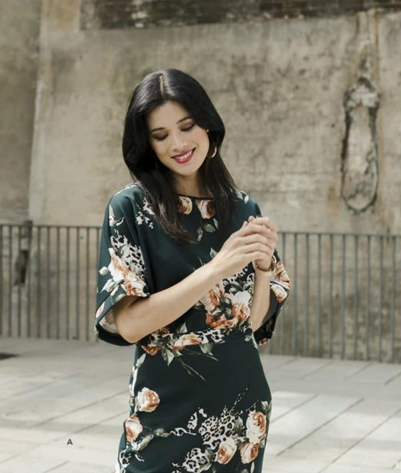
A. BIRD BY DESIGN The Printed Kimono Sleeve Pencil Dress BKBD-66-5 $129.95 (8-22) Made in Australia Landing in March