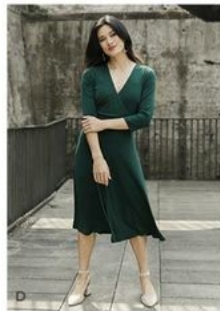
D. BIRD BY DESIGN The Faux Wrap Jersey Dress BKBD-482 $119.95 (8-22) Made in Australia Landing in March