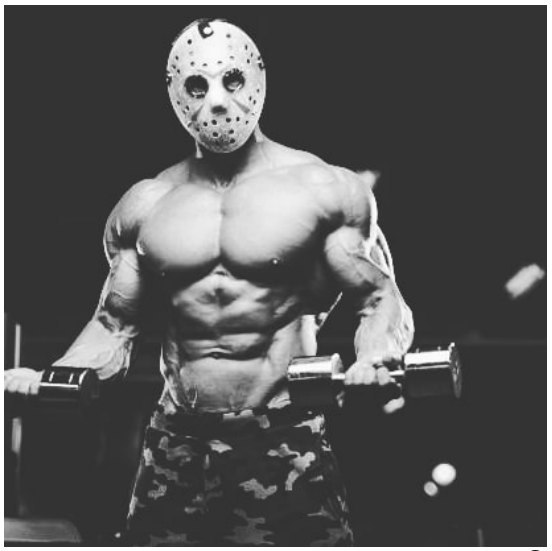
Ps: Vous pouvez en profiter pour reprendre le sport ça détend (un peu d'humeur dans ce monde de fou)