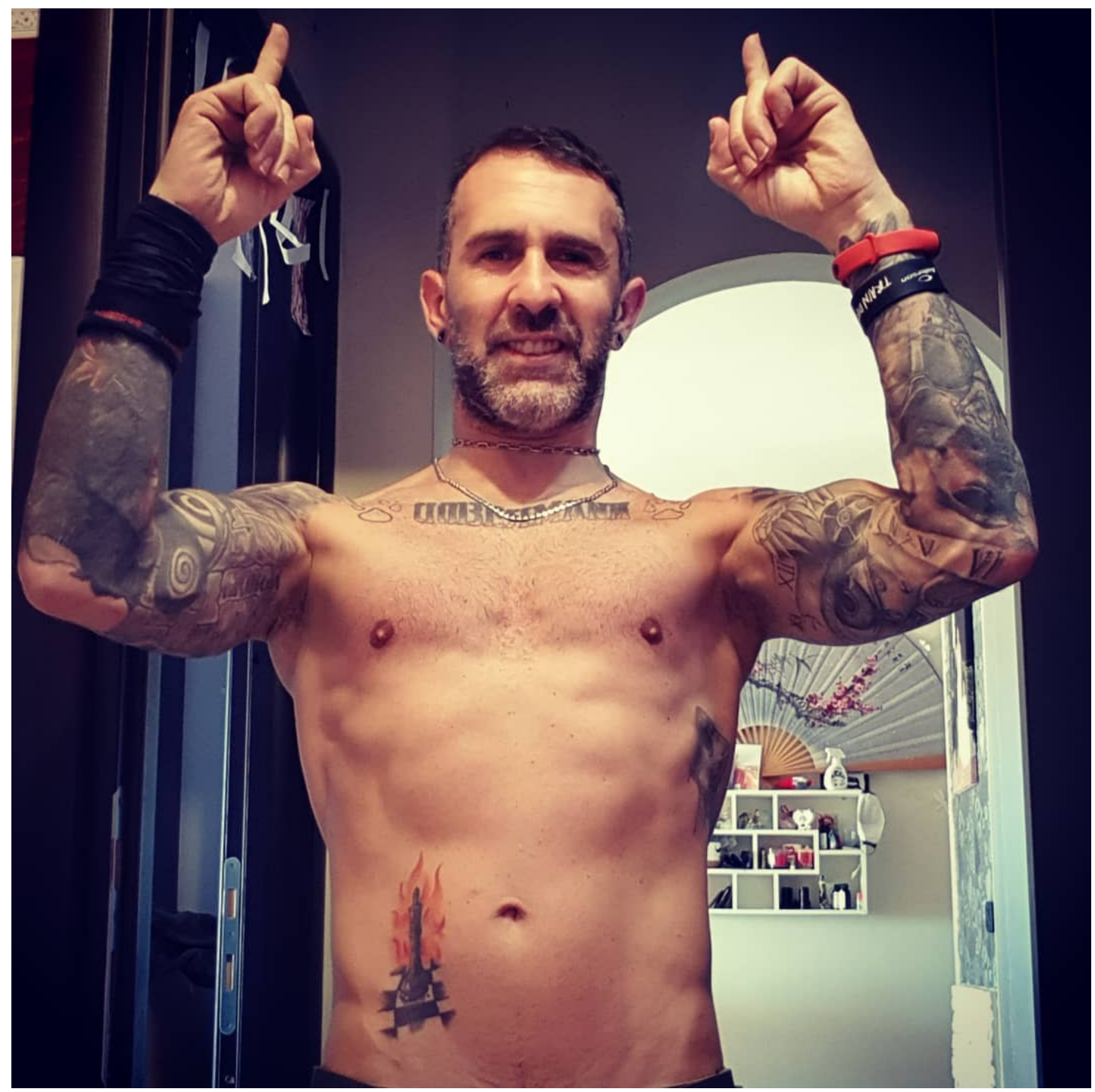
•Because your Mind & Body are only being put through the Intense demands &/or Maintenance it needs to endure the daily grind (including confinements) we go through to live the way we want.

\underline{\text{http://realanavarbest.over-blog.com/2020/04/discount-sustanon-250-mg-testosterone-propionate-by-maha-pharma-online-injectable-steroids.html}