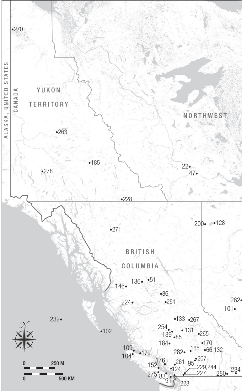
MAP 3: Fu-go incidents, Canada, 1944-45. Cartographer: Dixon Jones