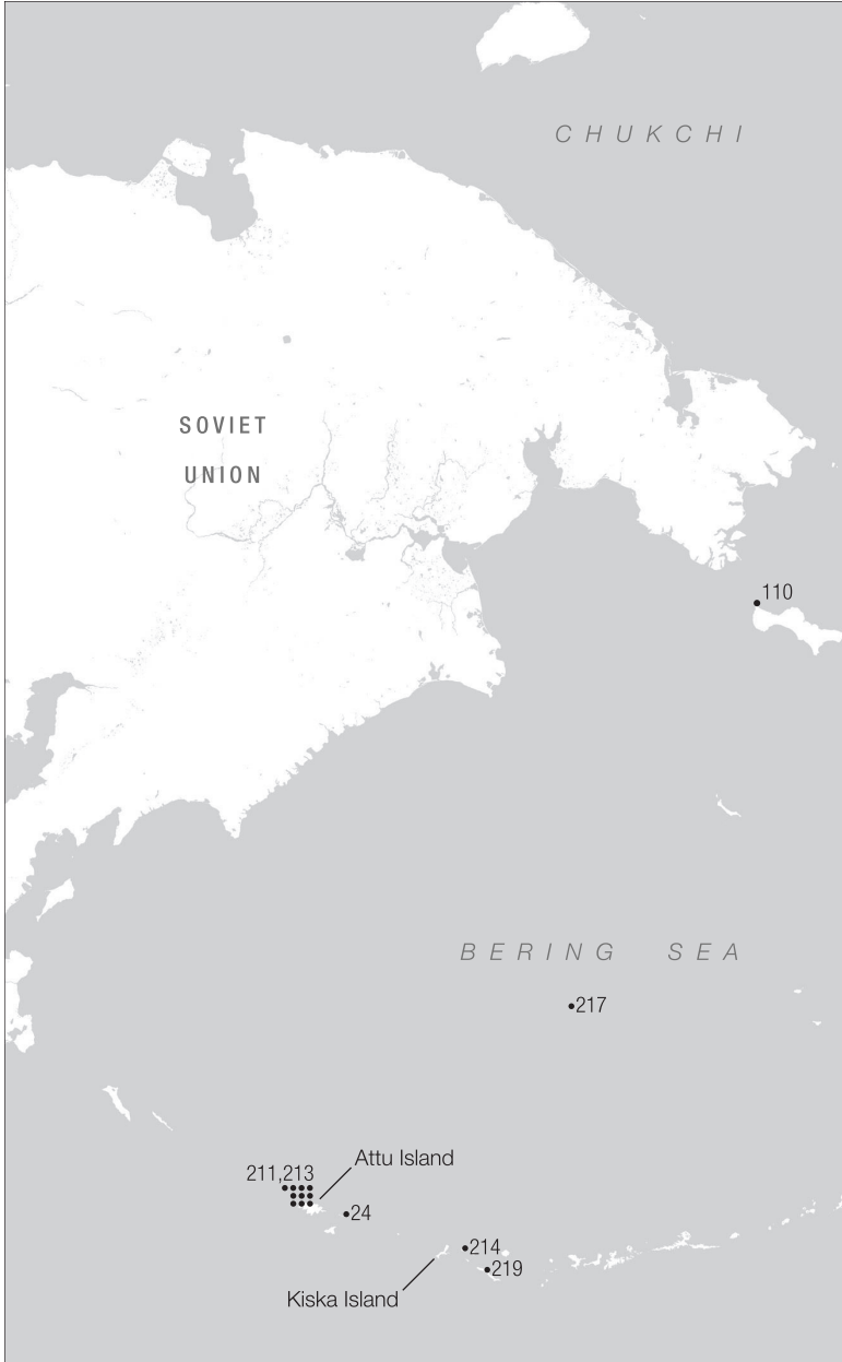
MAP 1: Fu-go incidents, Alaska, 1944-45. Cartographer: Dixon Jones