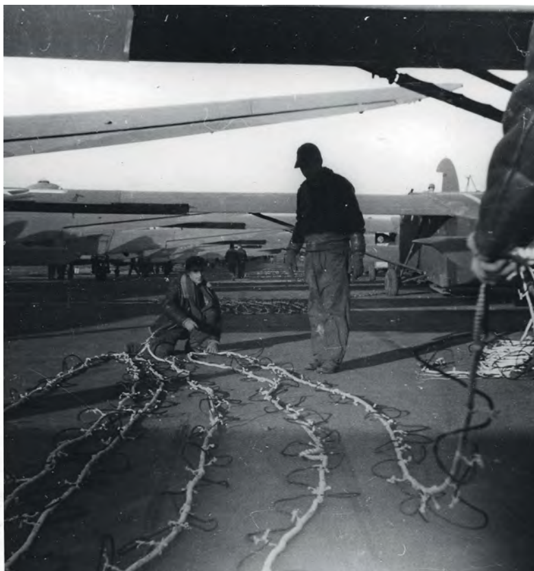
RIGHT Tow ropes made of durable nylon stretched 350ft and measured 1.7cm in diameter.

Most leading American aircraft manufacturers at the time were already producing powered machines under restrictive government contracts. Eventually, the Waco Aircraft Company (WACO) of Troy, Indiana, won the bid to design and help build the country's first combat glider, the CG-4A. They joined 15 other firms and subcontractors, including the Ford Motor Company, to fill the urgent demand. The 'Waco' (the RAF later renamed it Hadrian) featured a wingspan of 84ft (25.5m) with a fuselage constructed from honeycombed plywood, steel tubing and canvas. Cargo typically