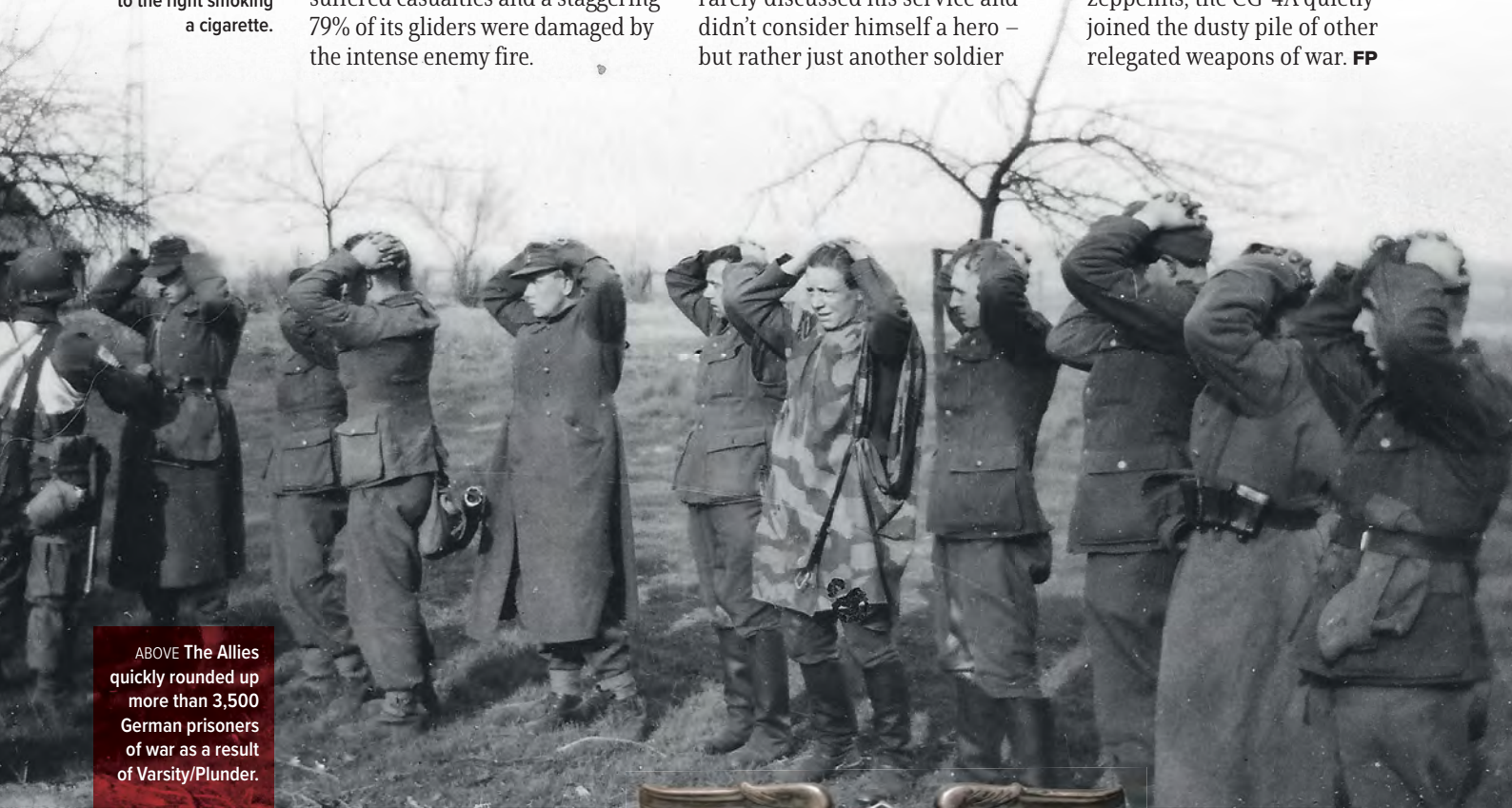
ABOVE The Allies quickly rounded up more than 3,500 German prisoners of war as a result of Varsity/Plunder.

By the time the next war rolled around, combat gliders had become obsolete and were replaced by the helicopter. Like Hannibal's battle elephants, flintlock muskets and gas-filled zeppelins, the CG-4A quietly joined the dusty pile of other relegated weapons of war. FP