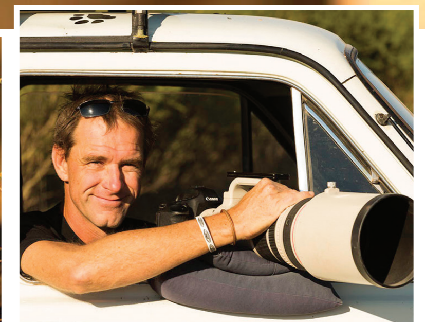
ABOUT THE PHOTOGRAPHER Bernd Wasiolka is a wildlife photographer with a background in animal ecology. Now based in Namibia, Bernd has travelled the world photographing the wilderness and animals of far off countries in Asia, Australia and Central America.