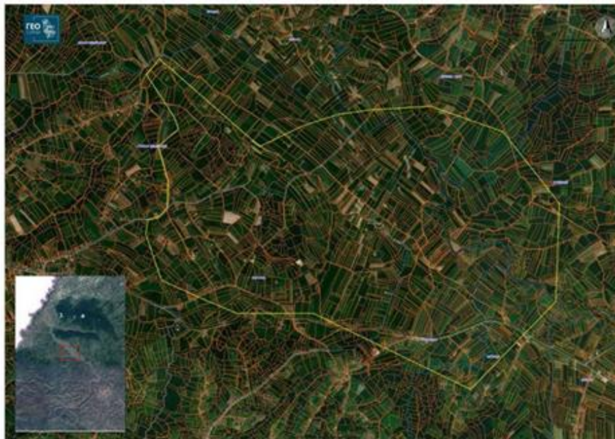
Drawing based on the coordinates provided in the FOI request above.