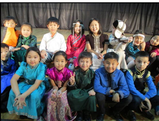
Students wear traditional costumes.

In Social Studies class, 3rd graders are learning about Mongolian cultural identity and heritage. They've studied topics such as history, homes, food, and different areas of Mongolia. On September 28, the 3rd grade held a fashion show to show off traditional and modern clothing from Mongolia.