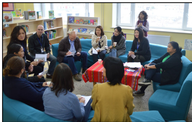
Parents participate in the Coffee and Conversation, the first of many library events planned.

Our library is working hard to bring about a love of reading to our students. Each week, we read a book that is fun, interesting, and engaging. We are also showcasing several authors in our "Author Spotlight" bulletin board. This month, we learned about the amazing Roald Dahl, the author of Charlie and the Chocolate Factory and The BFG. In October we will be celebrating International School Libraries Month.