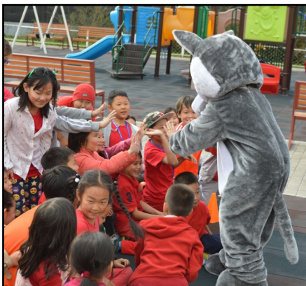
Howie the wolf greets students during the monthly Spirit Day.

Howie, the school's mascot, also made an appearance. The assemblies are held at the end of each month and also feature dances, skits and other ways for students to showcase their talents, as well as a time for recognizing our birthday celebrants for the month.