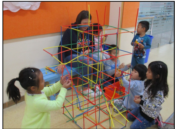
Using teamwork for a construction project

Kindergarten 1: This Autumn, we have been focusing on ourselves and specifically being able to