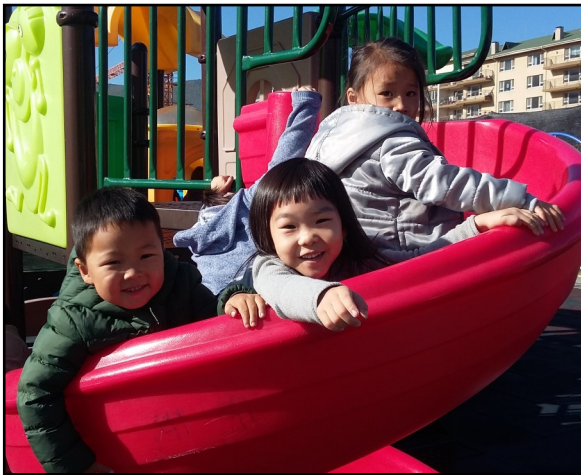
Making friends on the playground

sets the foundation for lifelong learning. During play, students will not only practice literacy, mathematics, and English language, but also self-control, independence, problem solving, critical thinking, emotional regulation, and social skills. All of these will help students achieve their full potential in future schooling and life. Anything a child needs to learn in the kindergarten years can be accomplished in a well-