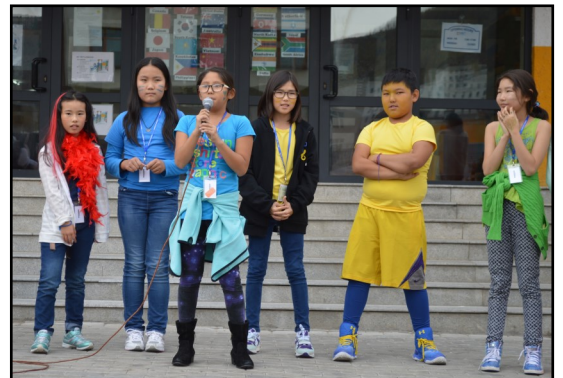
Captains and co-captains introduce themselves before leading a cheer for their Spirit House.

The first Spirit Day Assembly of the year combined the entire elementary school outdoors, where students received certificates for being academic achievers, for best effort and for showing the character trait of caring. Students were dressed in their Spirit House colors as captains and co-captains introduced themselves and led each house in a cheer.