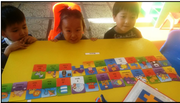
Ready for some alphabet fun in the classroom

This year the Early Childhood Education department at ASU is very excited to debut a new play-based program! The Ontario Ministry of Education has developed a new curriculum for the 2016 school year that is heavily based on play and inquiry. What looks like “just play” to many people is a well-planned, well-researched learning environment that