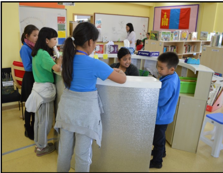
(Library, from p. 1)

also trying to get our parents involved. We've begun the dialogue by hosting a "Coffee & Conversation" event. It is an informal meeting with parents who would like to know what is happening in the school, and how they can better support their children. With parent interest, we hope to continue doing these once month. There are also other events in the works, stay tuned for more details.