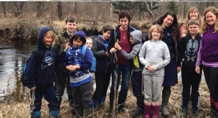
Belfast Bay Watershed Coalition www.belfastbaywatershed.org