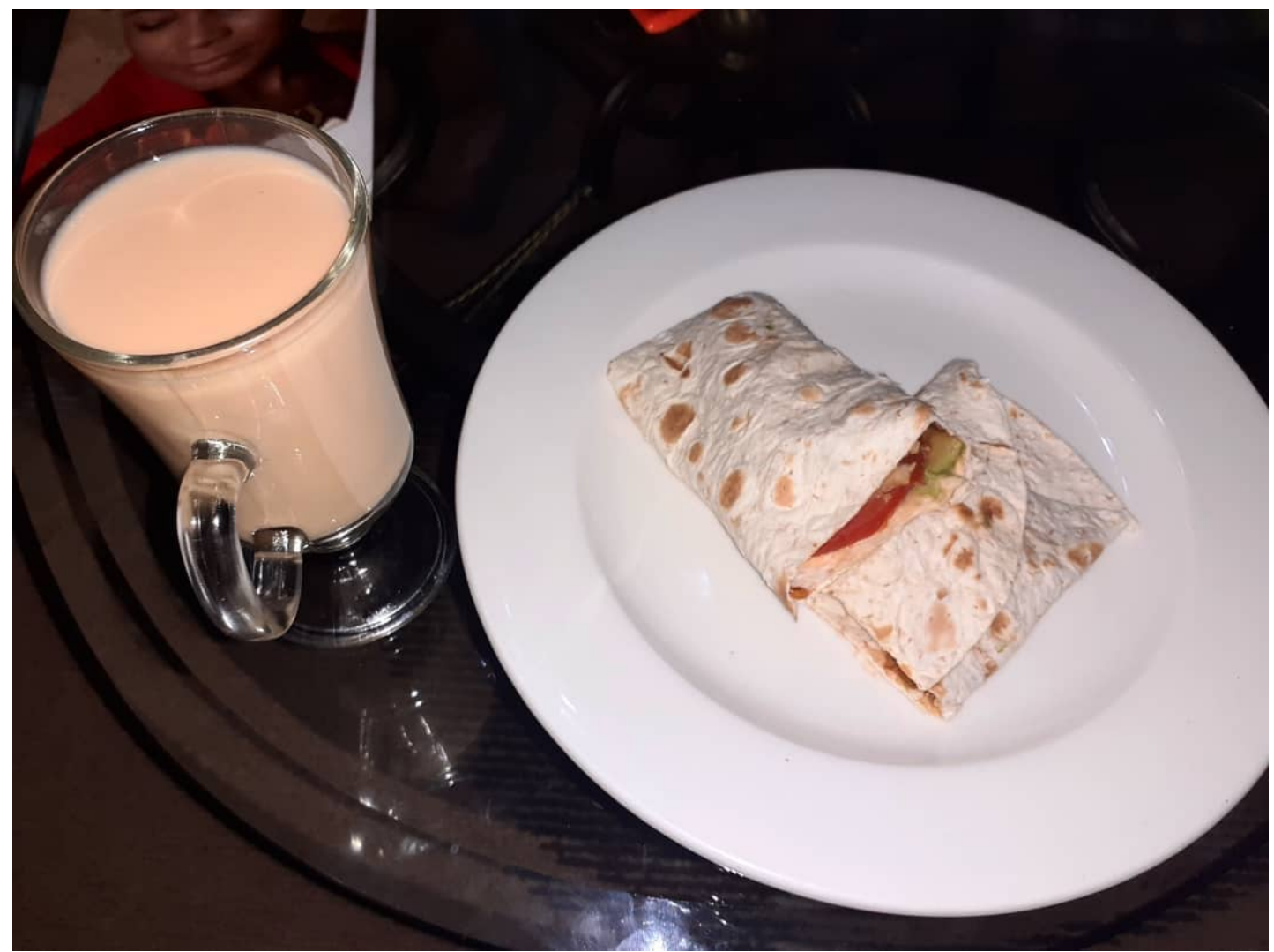
getfit# fitness# workout# fitnessmotivation# motivation# gym# fit# fitfam# training# health# exercise# fitnessaddict# bodybuilding# gymlife# cardio# healthy# fitspo# lifestyle# fitlife# strong# weightloss# instafit# healthylifestyle# fitnessmodel# personaltrainer# diet# fitnessjourney# eatclean# fitnessgoals# bhfyp

http://vasiliykj3s.blogmaster.net/post-acheter-turanabol-mg-en-pharmacie-by-dragon-pharma-tabs-52400.html