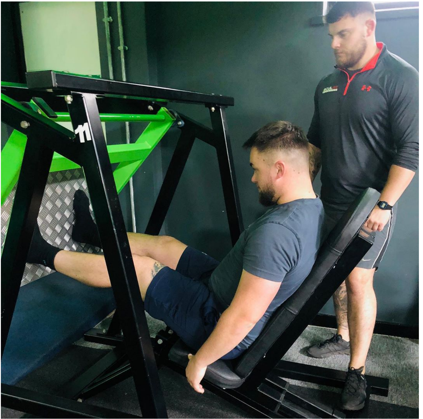
#hotguy #hotblondemuscle #muscleman #muscular #bodybuilder #bodybuilding #biceps #sexyman #stud #beautifulman #fitguy #sexyguy #hunk #flexing #gainz #bulky #gaymuscle