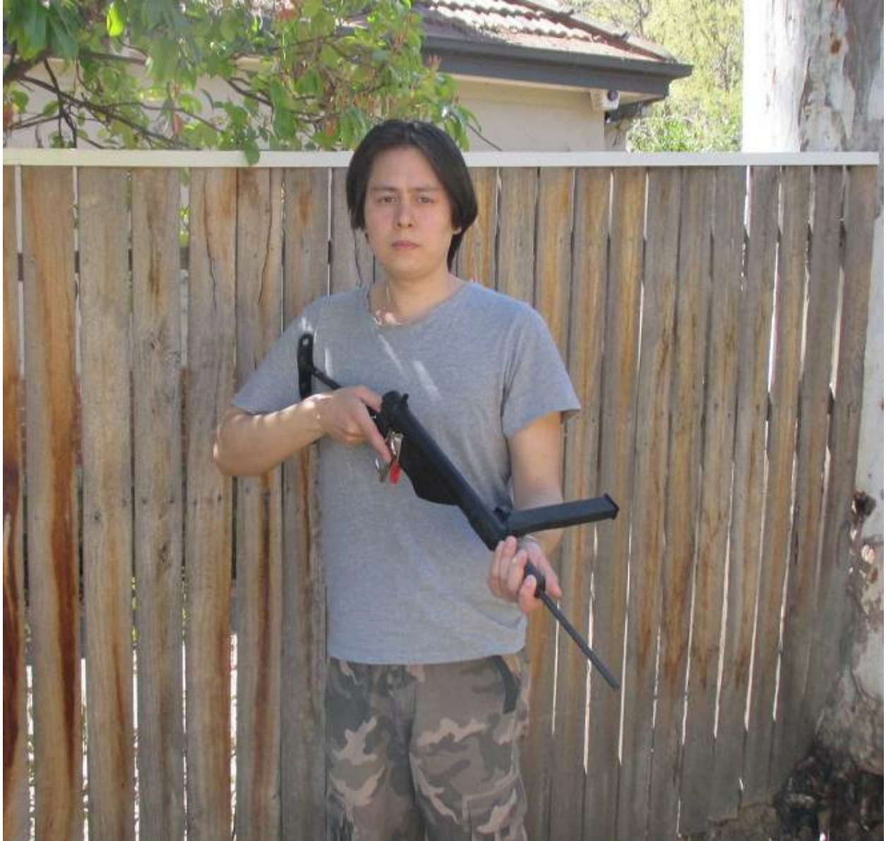
"Rise and resist!" Homemade gel blaster Sten, pew-pew!