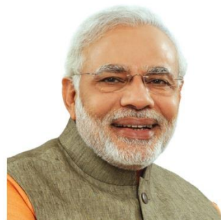
Mr. Narendra Modi, Hon'ble Prime Minister