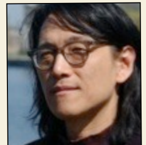
Li-Young Lee 2014 Poet in Residence

Li-Young Lee will hold a Master Class in Poetry on Saturday, May 31, 2014, from 1-4 pm, and will perform at the Evening Reading that night at 5:00 pm. Mr. Lee will officiate the next day, June 1, at the annual Whitman Birthday Celebration which recognizes the winners of the Young Poets Poetry Contest. Events are open to the public, all are invited to attend.