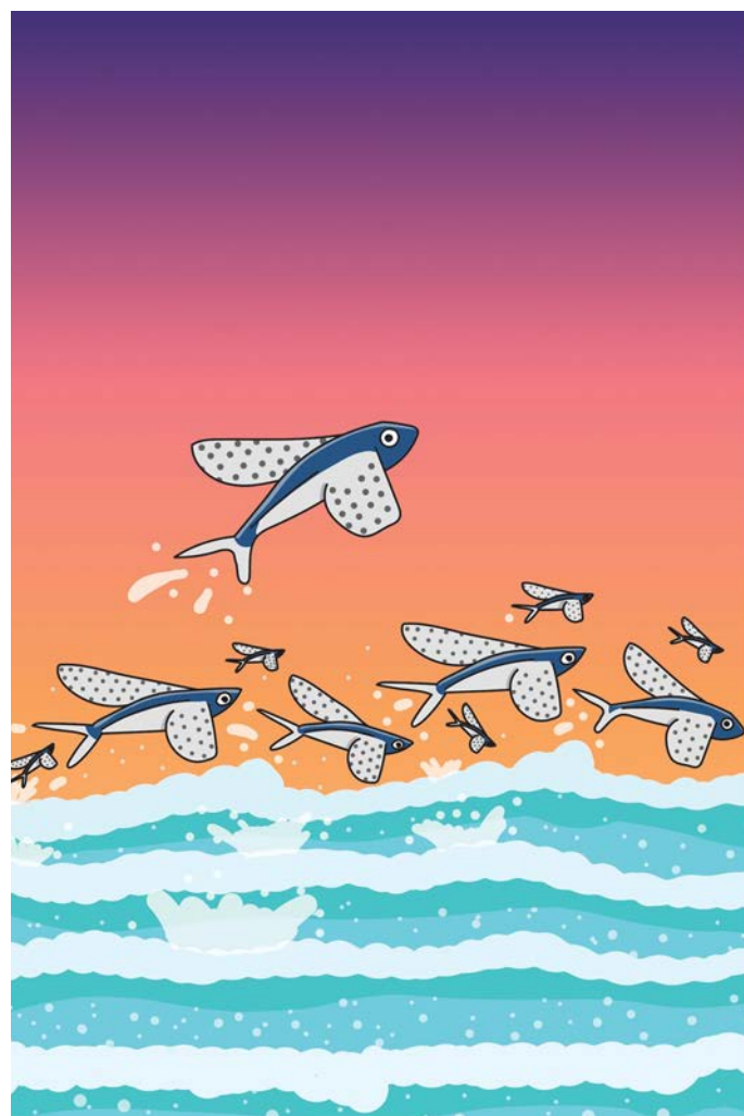
A panel from my NFT comic series

I love to get to the bottom of things, so in my free time, I study data analytics and programming to improve my knowledge of SEO/SEM, social media algorithms, and other dimensions of marketing analytics.