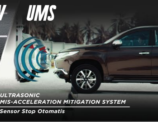
ULTRASONIC MIS-ACCELERATION MITIGATION SYSTEM Sensor Stop Otomatis