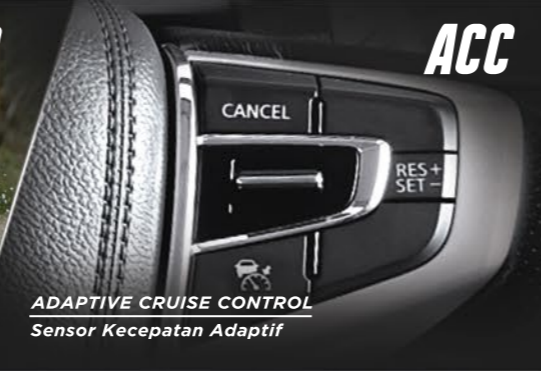
ADAPTIVE CRUISE CONTROL Sensor Kecepatan Adaptif