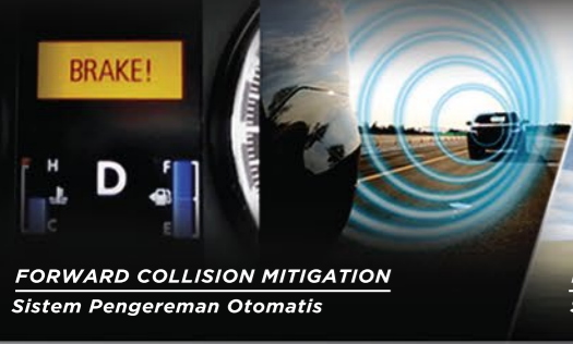
FORWARD COLLISION MITIGATION Sistem Pengereman Otomatis