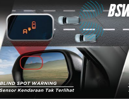
BLIND SPOT WARNING Sensor Kendaraan Tak Terlihat