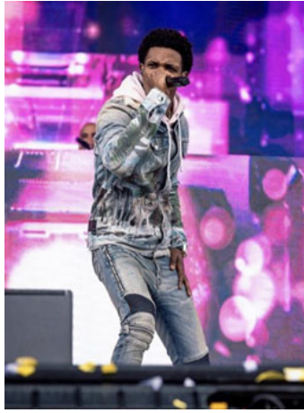
A-Boogie Wit Da Hoodie